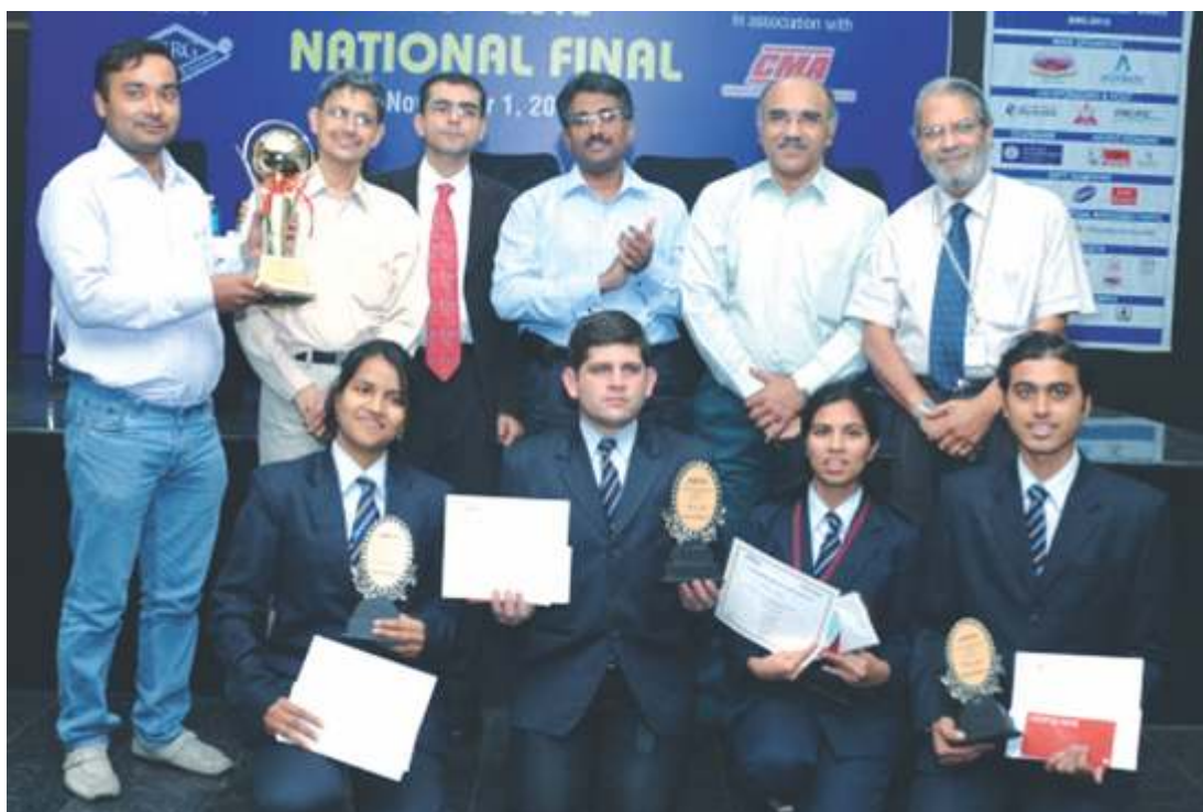
FMS - Pacific University, Udaipur, National Champions of the 16th Student Management Games.

Various business schools employ AIMA's business simulation to train their students in MDP, executive programmes and regular programmes. Some of the business schools that used AIMA's business simulation are ISB Hyderabad and Mohali, MSM Meerut, NDIM, KCT Coimbatore, Allana School of Management amongst others.