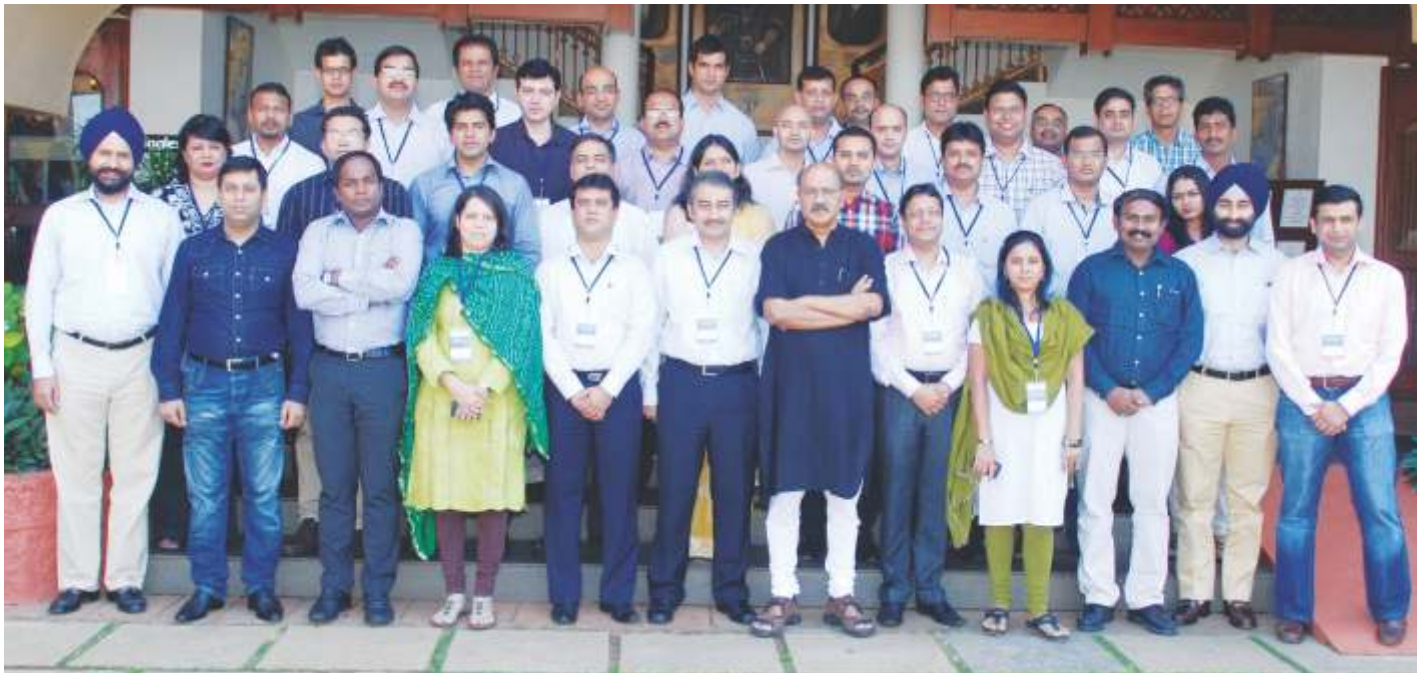
Participants at the Retreat with the session speakers.