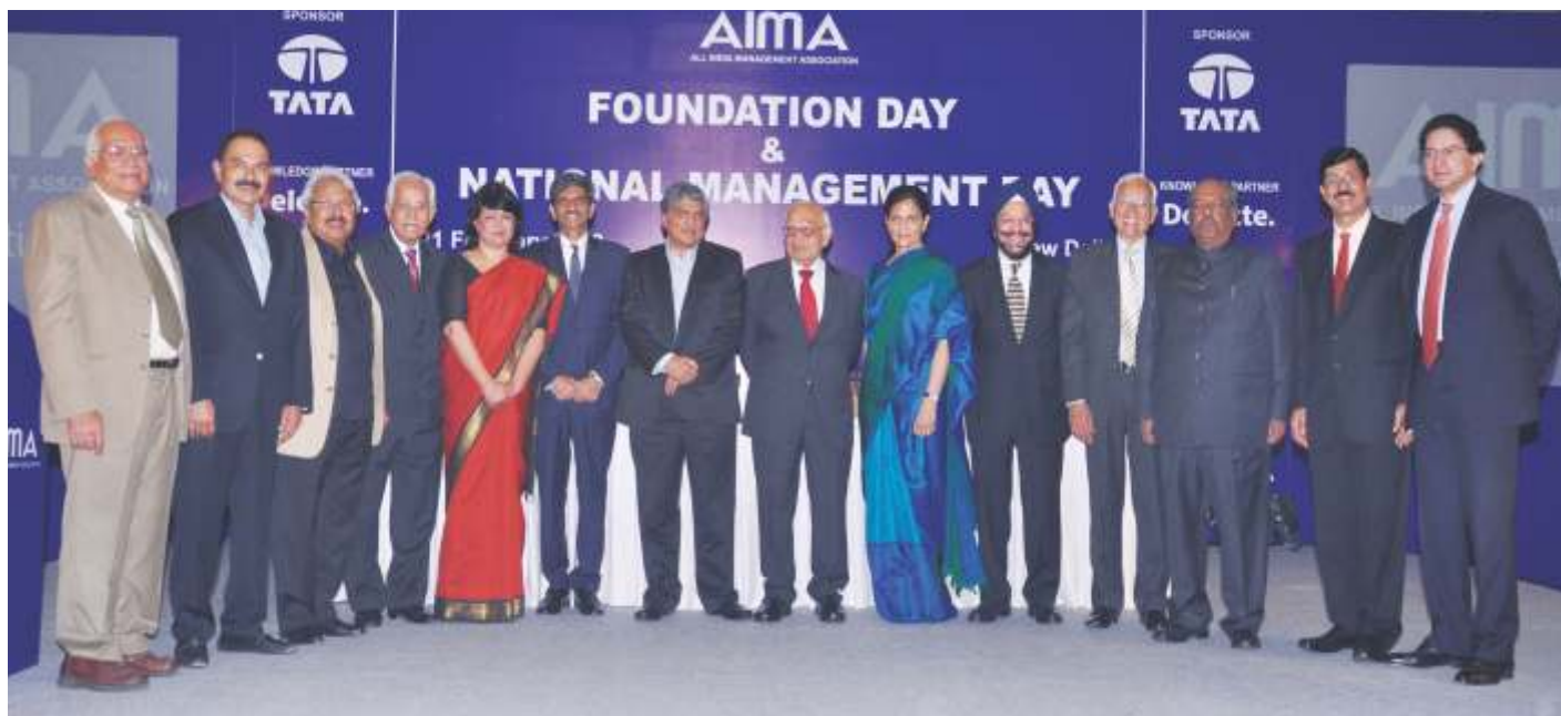
AIMA Past Presidents and Office Bearers with Nandan Nilekani, Chairman, Unique Identification Authority of India.

On the occasion of AIMA's 57th Foundation Day and 7th National Management Day eminent personalities from various sectors were felicitated.