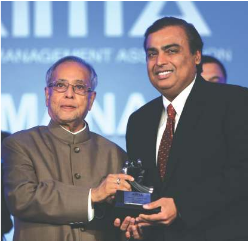
Mukesh D Ambani, Chairman & Managing Director, Reliance Industries Ltd. receiving the Entrepreneur of the Decade Award from the President of India, Pranab Mukherjee.