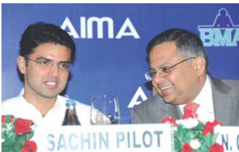
Sachin Pilot, Minister of Corporate Affairs with N Chandrasekaran, Managing Director & CEO, TCS & Convention Chairman.