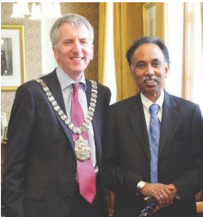
SD Shibulal, CEO, Infosys with Belfast City Council Lord Mayor, Mairtin O Muilleoir.