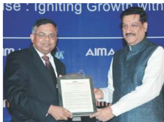
N Chandrasekaran, Managing Director & CEO, TCS & Convention Chairman receiving AIMA Honorary Life Fellowship from the Chief Minister.