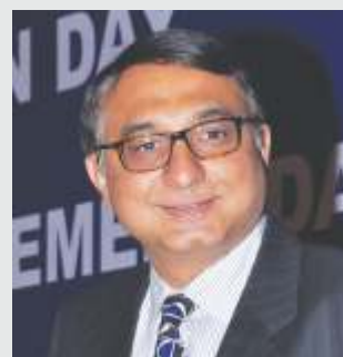
AIMA-Dr JS Juneja Award for Creativity and Innovation for Small and Medium Enterprises presented to Omni Lens Pvt. Ltd.