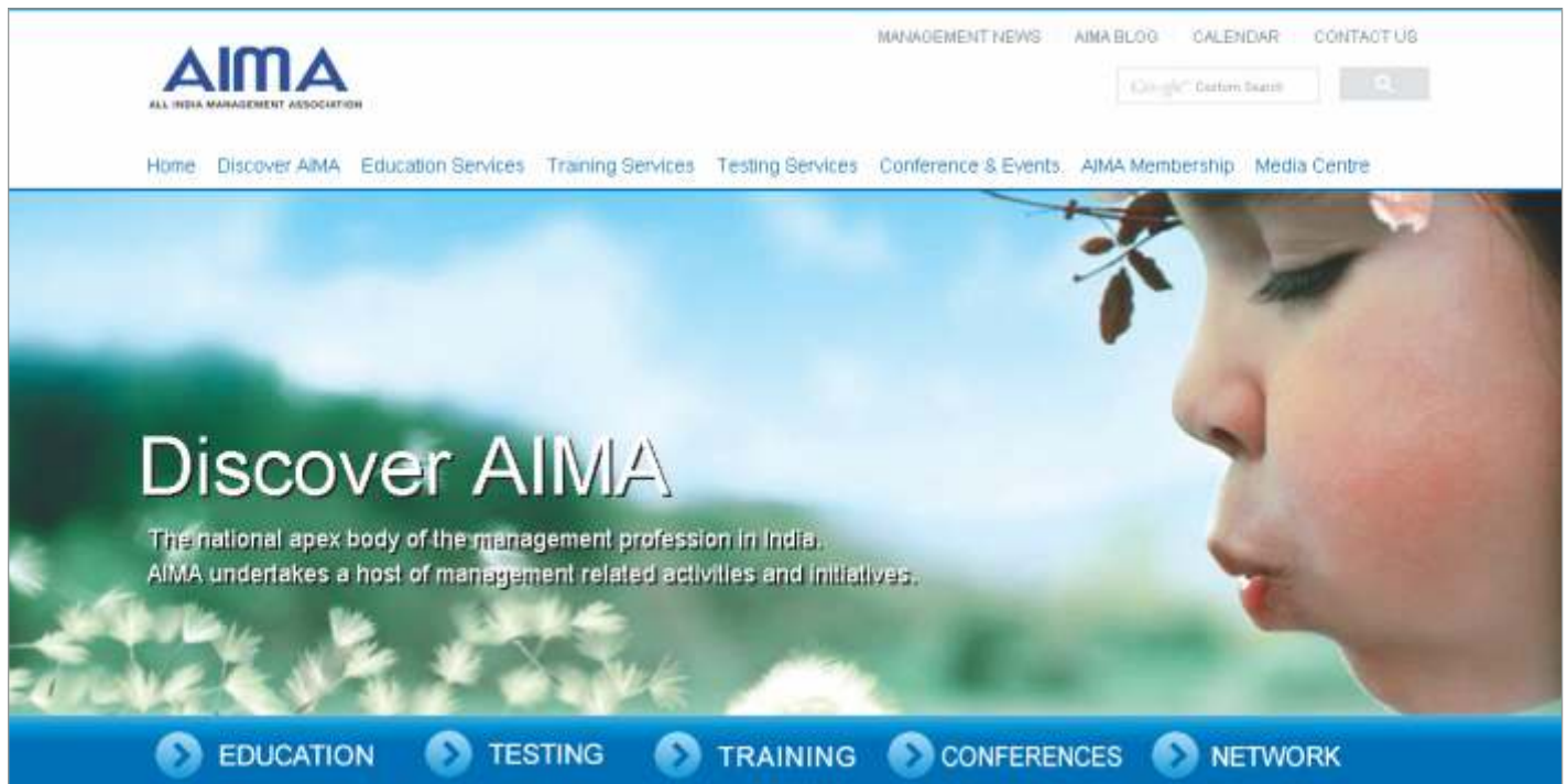
AIMA's new website.

Understanding the importance and effectiveness of social media, AIMA initiated its social media campaign in 2011 with the help of Nokia's Digital Marketing team. A strong social media presence adds to the brand value and increases salience, with the opportunity of a two way dialogue with consumers and supporters. Along with the revamp of the AIMA website, social media properties were created on all major platforms like Facebook, LinkedIn, Twitter and YouTube. An exclusive AIMA Blog site was also created which showcases thoughts and opinions of leaders from India Inc, the Indian government, academia and policy makers.