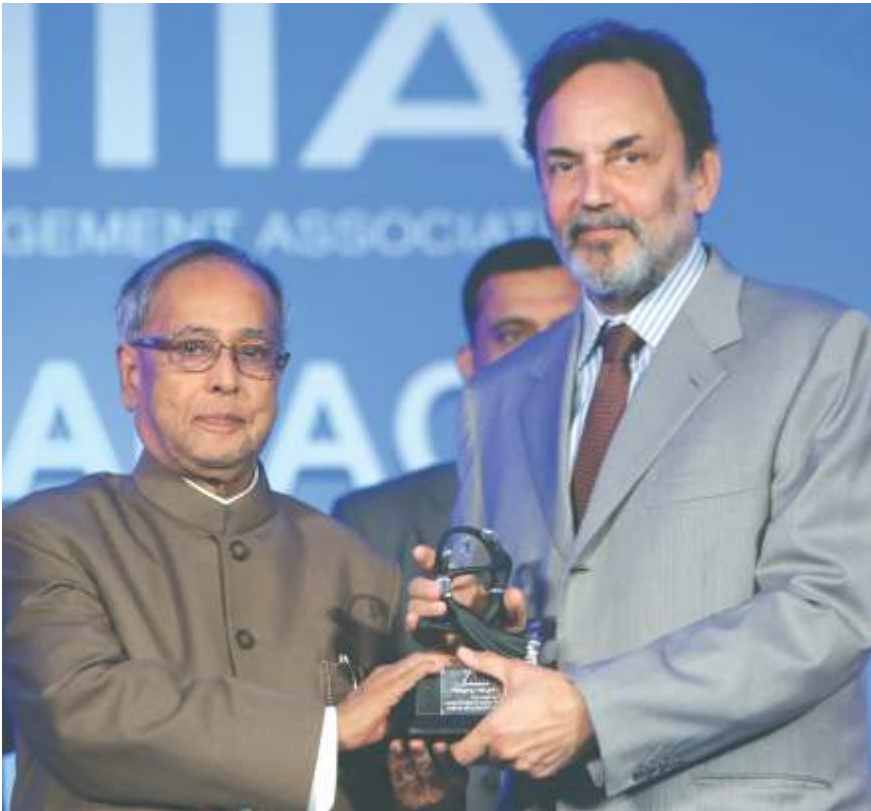
President of India, Pranab Mukherjee presenting the Outstanding Contribution to Media Award to Prannoy Roy, Executive Co-Chairperson and Editor-in-Chief, NDTV.