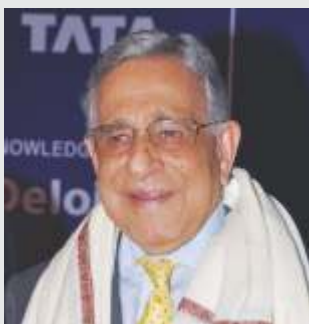
P R S (Biki) Oberoi , Chairman, EIH Ltd. honoured with AIMA Life Time Achievement Award for Management

On the occasion of AIMA's 57th Foundation Day and 7th National Management Day eminent personalities from various sectors were felicitated.