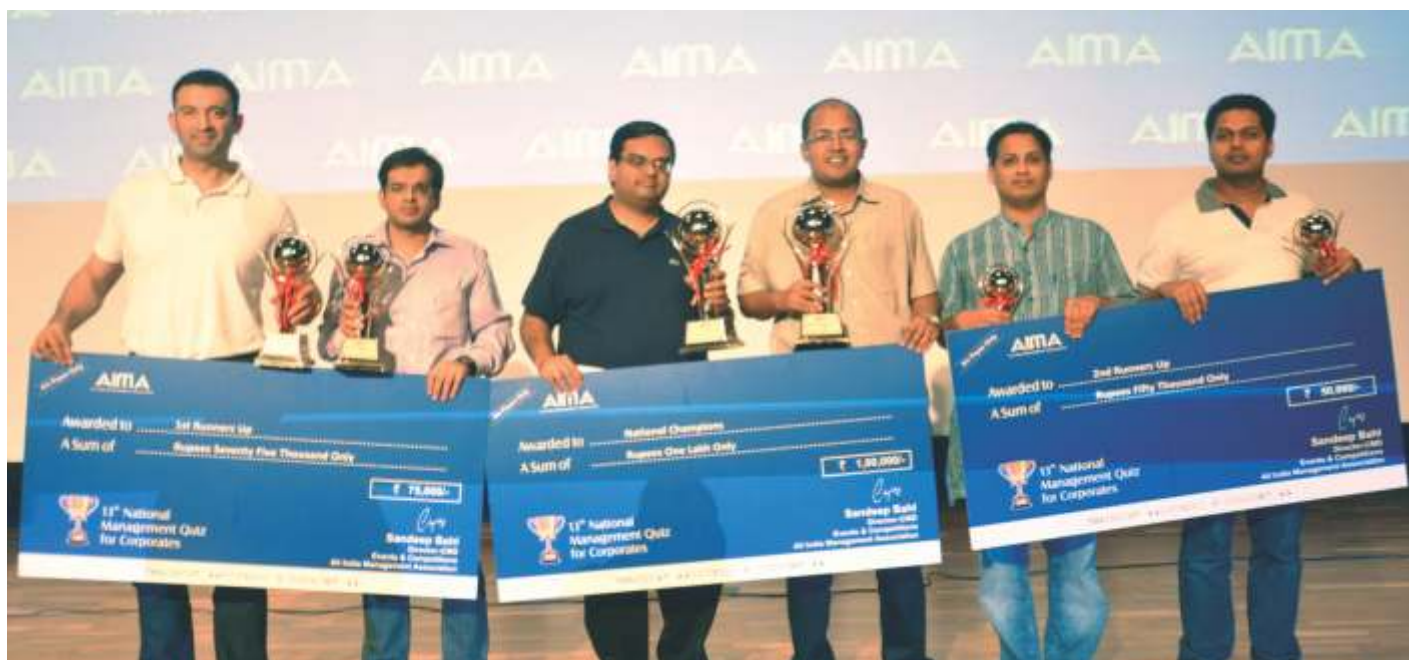
13th National Management Quiz winners.