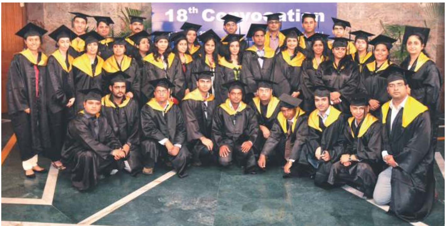
AIMA students at their Convocation.

AICTE extended approval to AIMA Centre for Management Education for the PGDM and PGDITM programmes for the academic year 2013-14. Distance Education Council (DEC) approved AIMA CME for PGDM, PGDITM, PGCM and ACM programmes for the academic years 2012-13 and 2013-14.