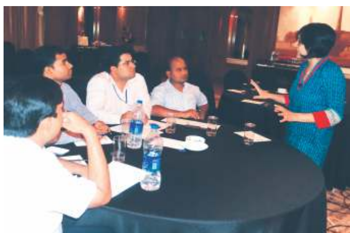
Training on 'Effective Managerial Skills' being conducted at Centre for Development of Telematics.