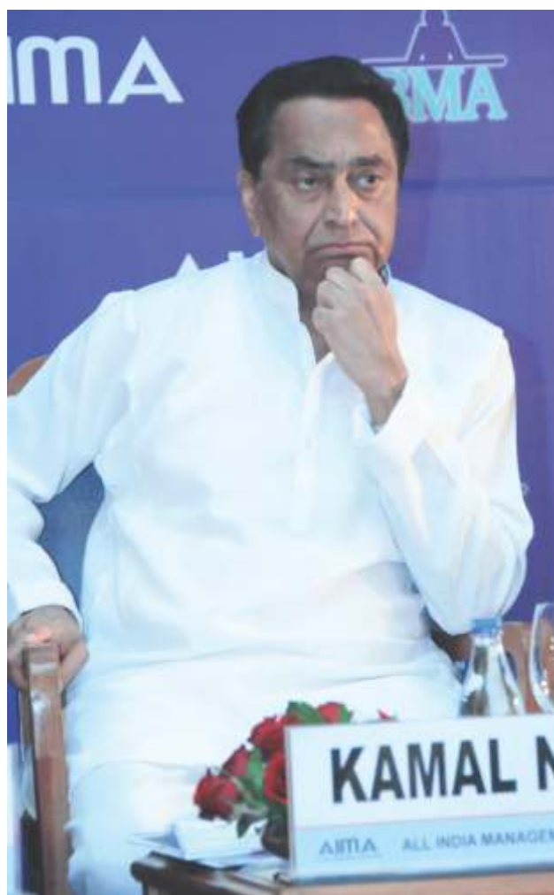
Kamal Nath, Minister for Urban Development & Poverty Alleviation at the Convention.