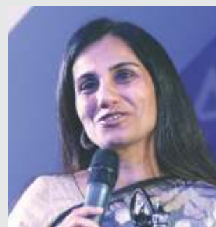
Chanda Kochhar , MD, ICICI Bank will be awarded with the AIMA-JRD Tata Corporate Leadership Award at the 40th National Management Convention