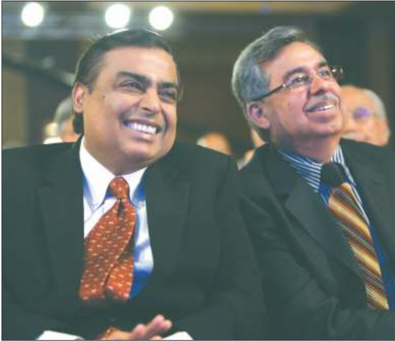
Mukesh D Ambani and Pawan Munjal sharing a light moment.