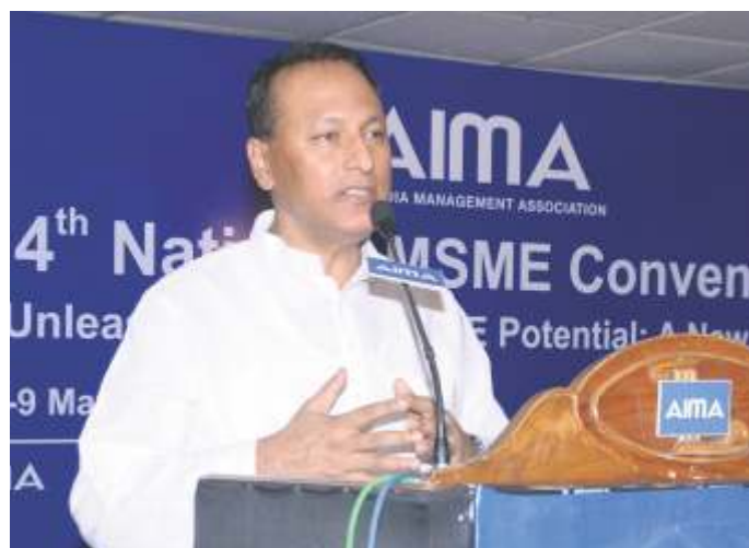
Pradyut Bordoloi, Minister of Industries & Commerce, Power (Electricity) & Public Enterprises, Government of Assam, addressing the MSME Convention.

With the objective of capacity development of MSMEs of India, AIMA is planning to conduct a series of MSME workshops jointly with LMAs all over India in the current year.