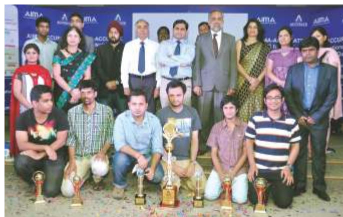
9th National Student Quiz winners.

AIMA's 'PRAGATI', organised for the first time, attracted 70