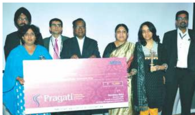
PRAGATI - Womens Quiz 2013 winners.