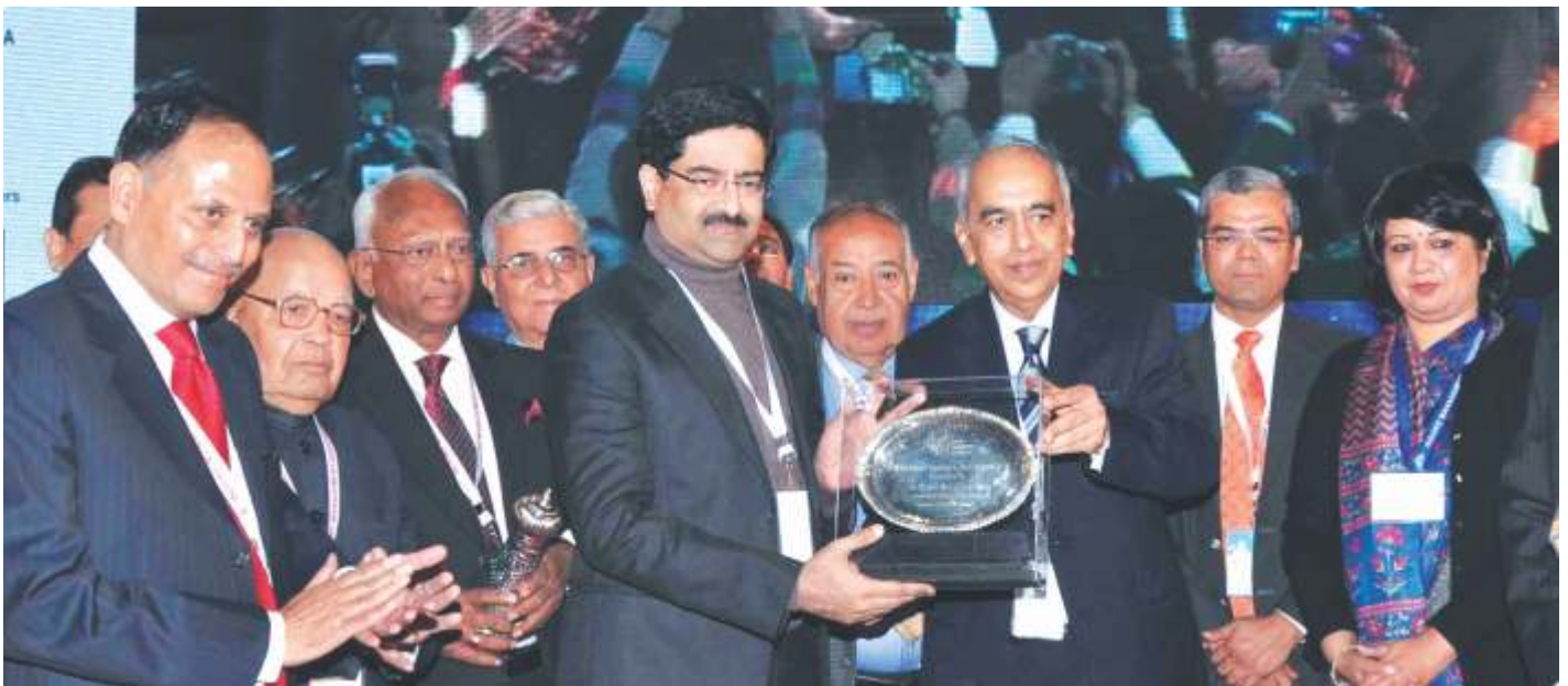
Kumar Mangalam Birla being conferred with IMA National Business Icon Award instituted by Indore Management Association.