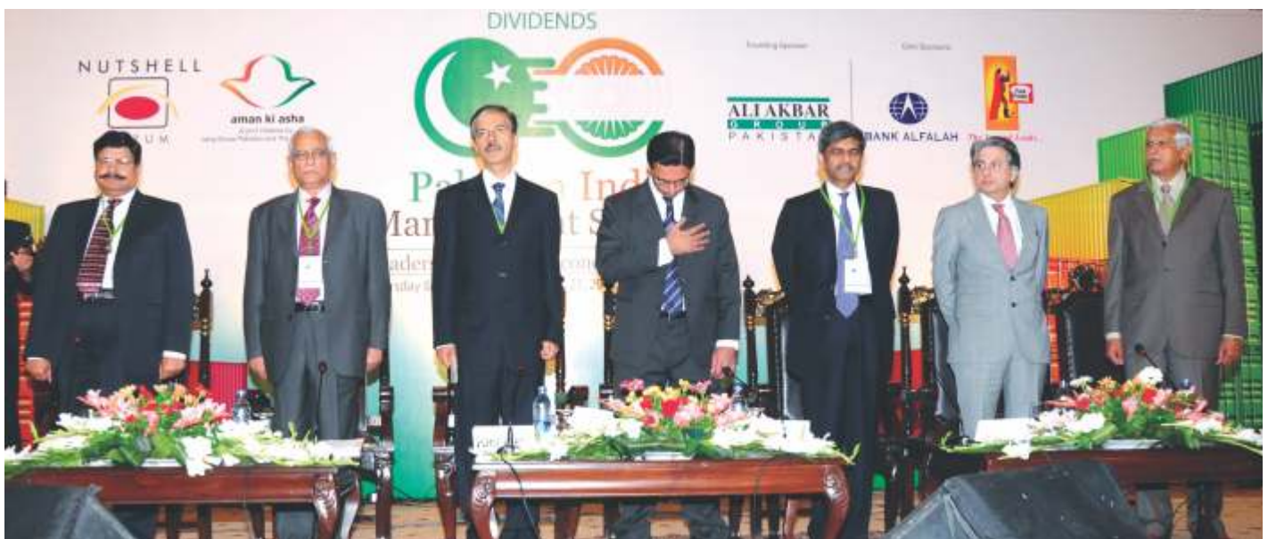
Speakers from India and Pakistan at the inaugural session.