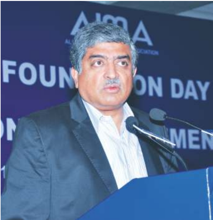
Nandan Nilekani, Chairman, Unique Identification Authority of India (UIDAI) addressing the Convention.