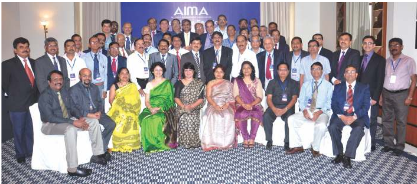
LMA representatives with AIMA President and office bearers.

AIMA took several initiatives to improve coordination with the 64 regional affiliates and two overseas cooperating members. AIMA leadership reached out to the local management associations (LMAs) and strengthened ties for enhanced collaboration.