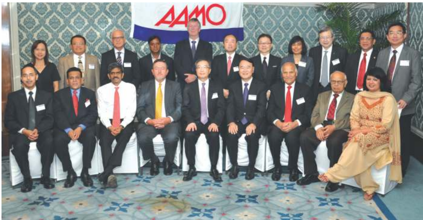
Delegates at the AAMO meeting .