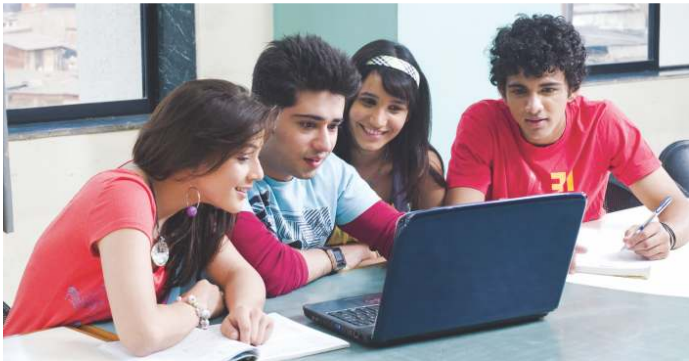
Students preparing for MAT.

Providing customised testing services for public and private organisations