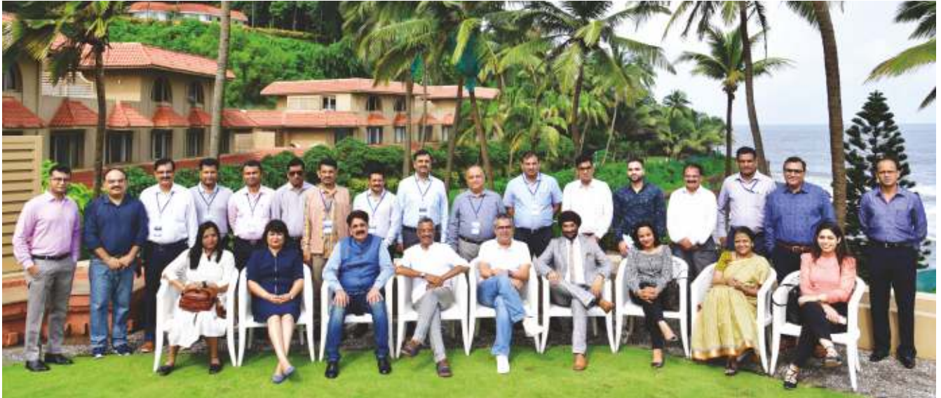
Participants at the 8th HR Leadership Retreat