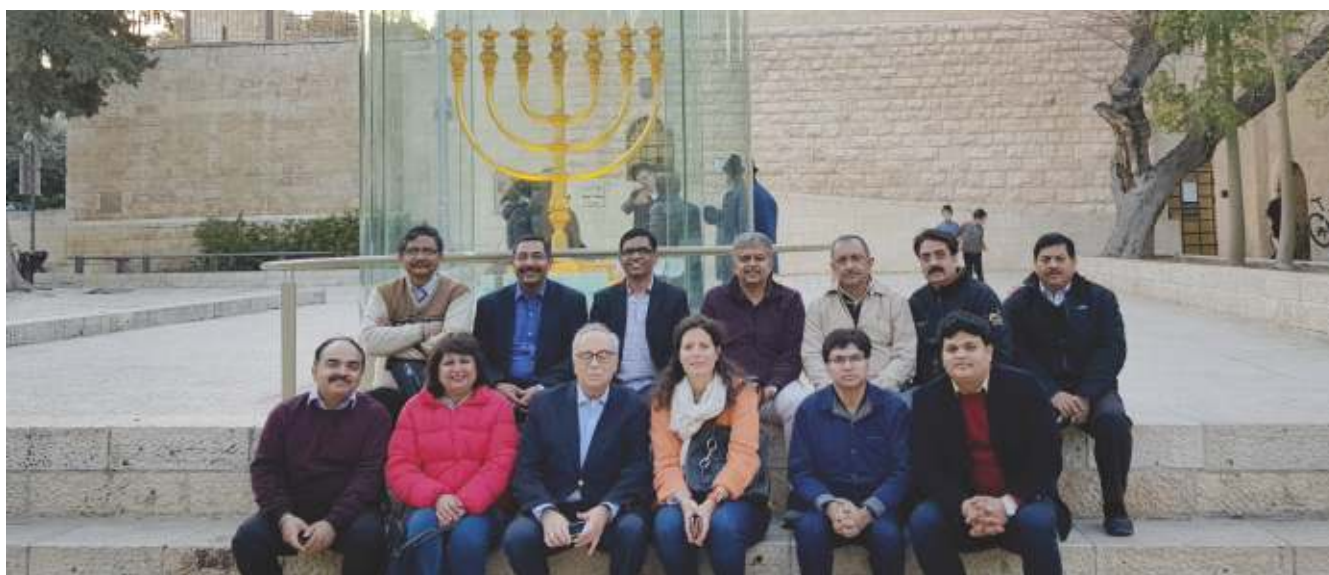
Delegates of Global Advanced Management Programme - Israel