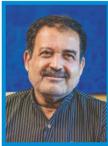
IMMEDIATE PAST PRESIDENT TV Mohandas Pai