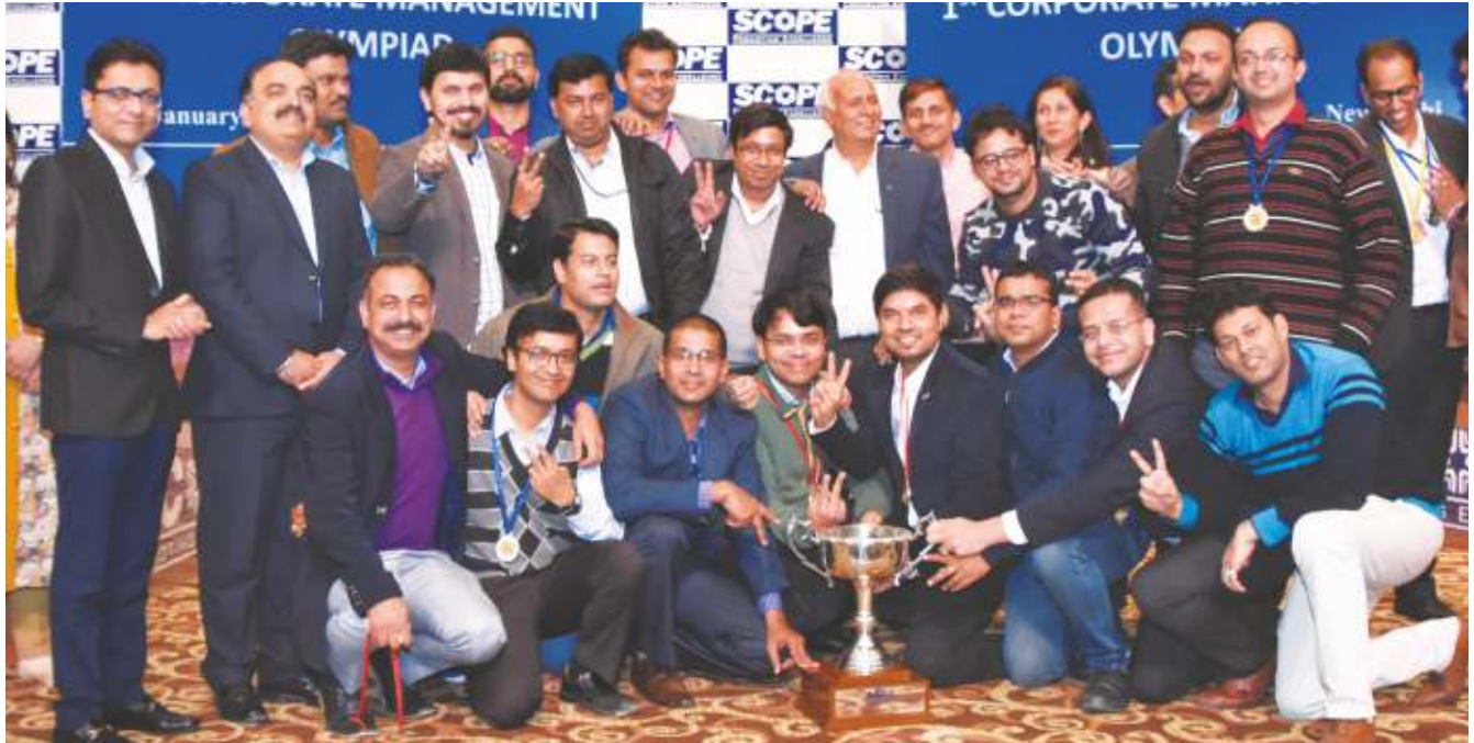
Winners of the 1st Corporate Management Olympiad

AIMA organised its 1st Corporate Management Olympiad on 22nd January 2019 at New Delhi. The goal of the Corporate Olympiad was to create a platform for managers to exchange thoughts, ideas and skills in a spirit of healthy competition; where individuals and corporates were recognised and feted for their competencies and achievements and encouraged to compete for corporate glory.