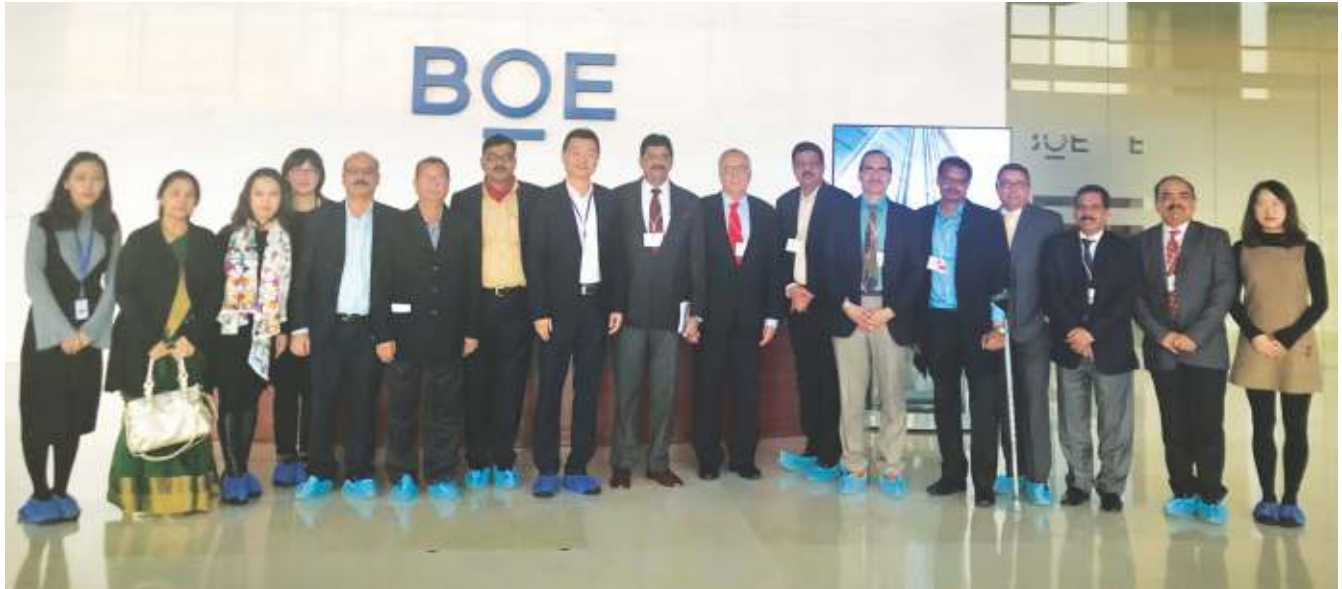
Participants of the 14th Global Advanced Management Programme - China