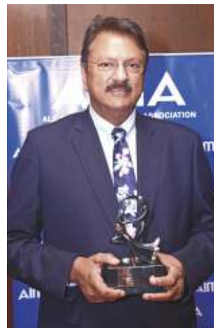
Ajay G Piramal, Chairman, Piramal Group recipient of the AIMA Managing India Award for Business Leader of the Year