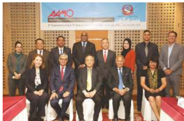
AAMO Council Members

AIMA is an important and long-time member of AAMO, an association of National Management Organisations of Asia Pacific, which promotes professional management in the Asia Pacific region. Some of the key member countries, apart from India, include Malaysia, Australia, Hong Kong, Macau, Philippines, New Zealand, Sri Lanka, Republic of Korea, Nepal and Pakistan.