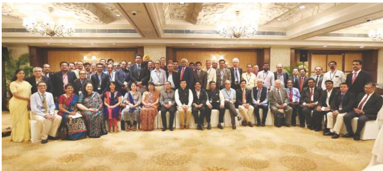
Participants of LMA CEO workshop

overseas individuals. A member of AIMA can also take international membership of other AAMO country NMO at a subsidised membership fee of USD 35 annually.