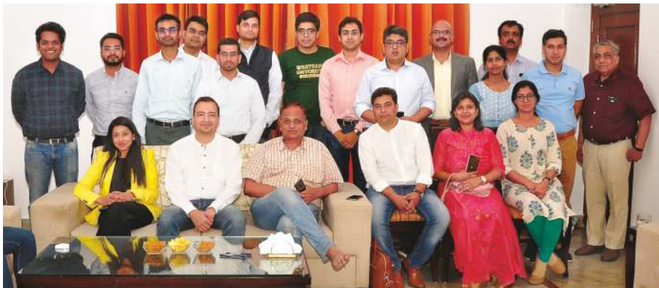
Satyendra Jain, Senior Cabinet Minister, Delhi Government with Young Leaders Council members

Minister, Delhi Government was organised on 4th May 2019 at New Delhi. The session was very interesting and insightful where YLC members raised their concerns on Delhi pollution, roads, electricity, healthcare etc.