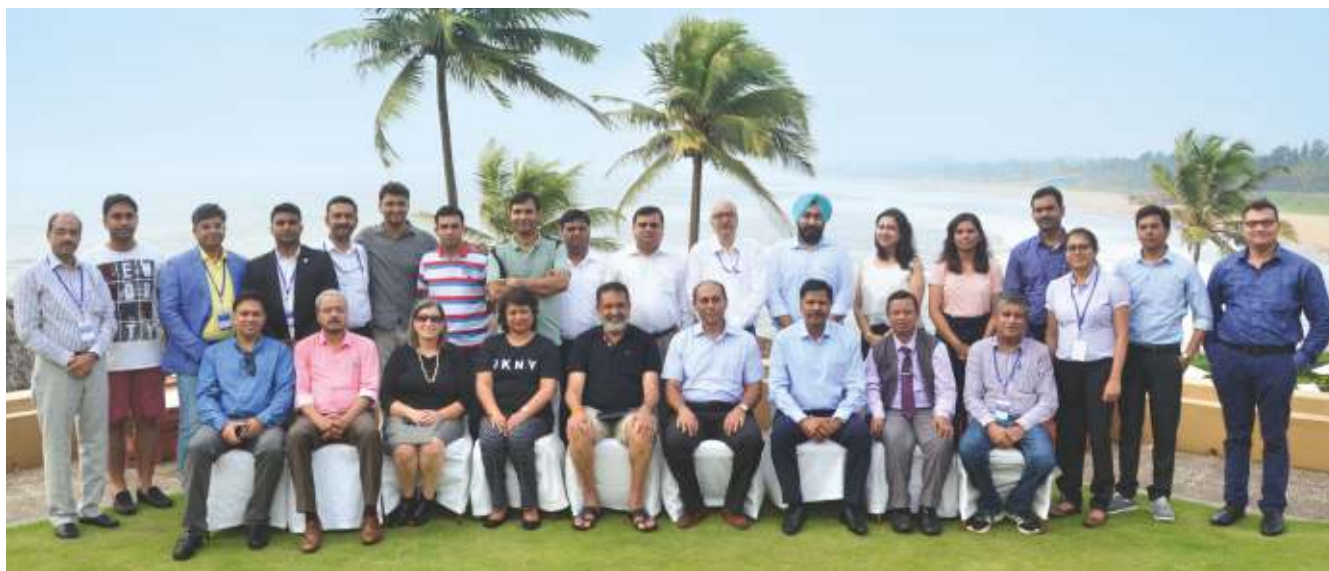
Participants at the 1st AI & Big Data Retreat