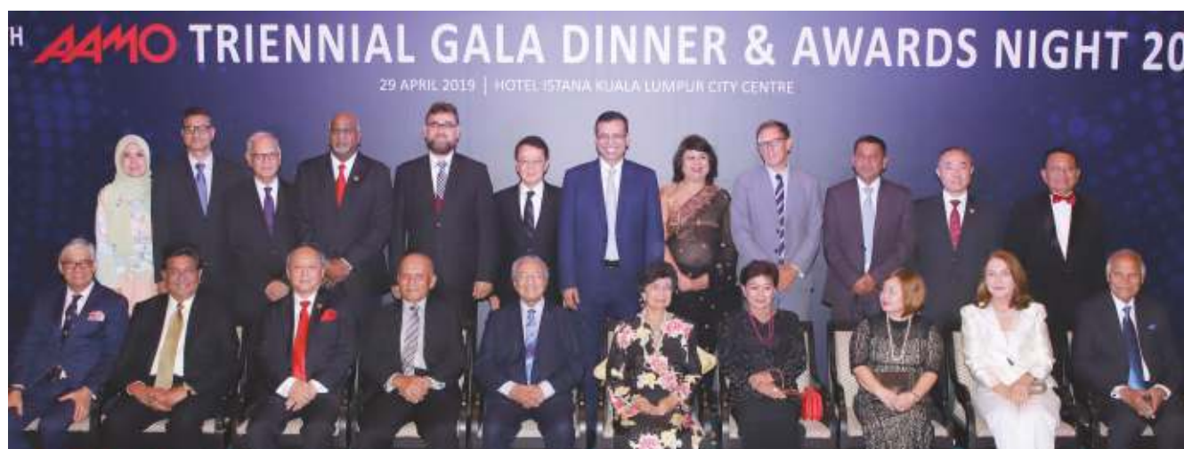
AAMO Council Members at the 20th AAMO Triennial Gala Dinner & Awards Night 2019

The first AAMO Council meeting for the year 2019- 2020 was also held on this occasion on 28th April 2019.