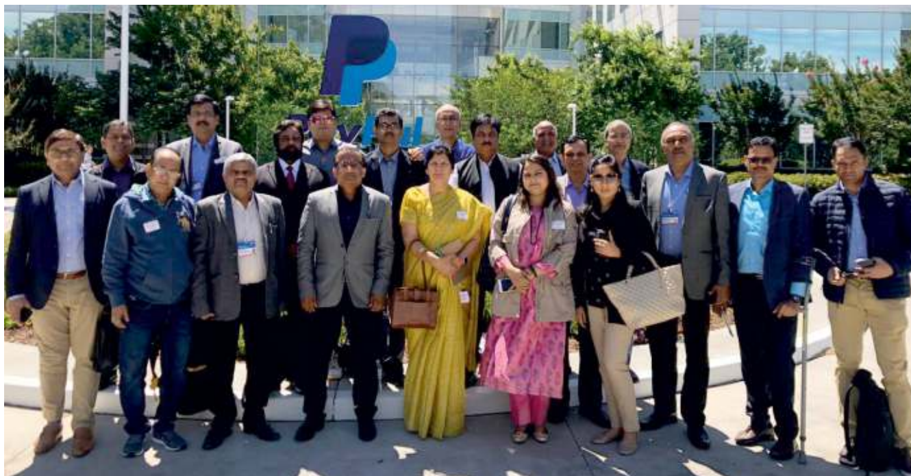
Delegates at PayPal