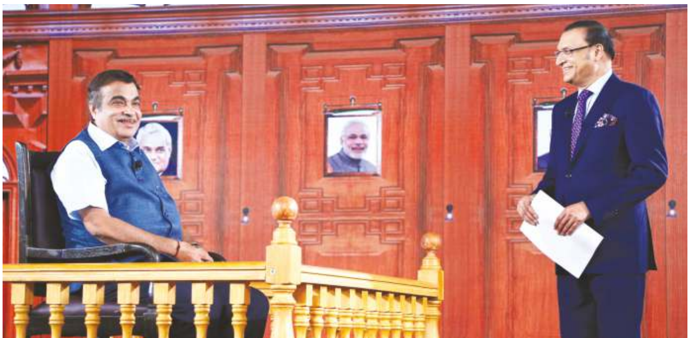
Nitin Gadkari, Minister of Road Transport & Highways; Micro, Small & Medium Enterprises, Government of India and Rajat Sharma, Chairman and Editor-in-Chief, India TV, during Aap ki Adalat at AIMA's NMC