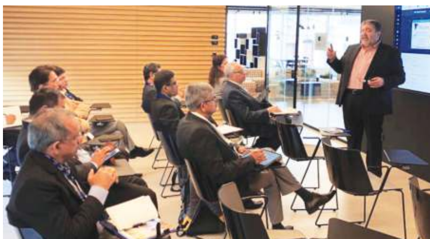
Participants at OurCrowd