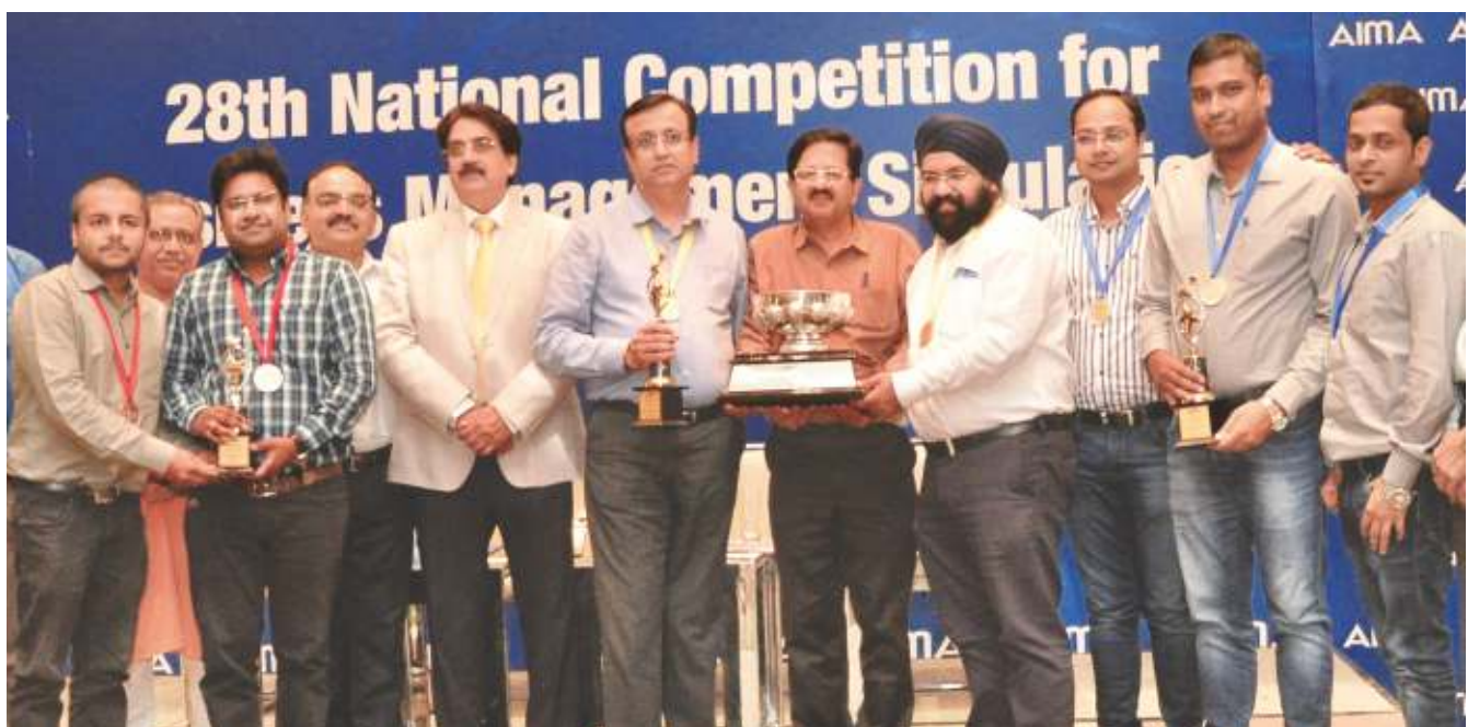
Winning teams of the 28th National Competition for Business Management Simulation

AIMA BizLab has been launched at a few institutes including AURO University (Surat), Firebird Institute of Research in Management (Coimbatore), GNA University (Phagwara), Meerut Institute of Engineering and Technology (Meerut), Suryadatta Group of Institutes (Pune), BML Munjal University (Gurgaon), PSIT (Kanpur), JK Business School (Gurgaon) and Assam Down Town University (Guwahati).