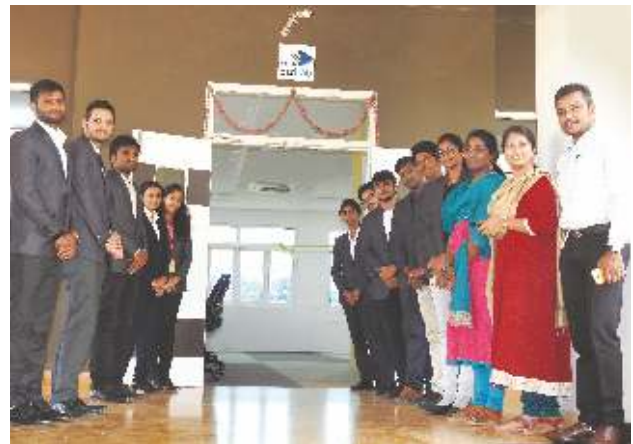
Inauguration of AIMA BizLab

AIMA launched www.AIMABizLab.com – the first of its kind virtual lab for management students in India. It allows students to experiment with various management strategies and tactics