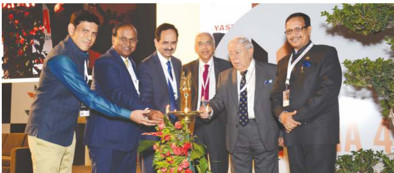
Inauguration of the IMA 28th International Management Conclave