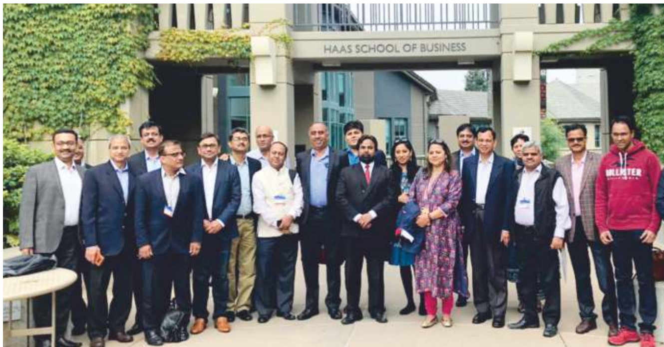
16th Global Advanced Management Programme delegates