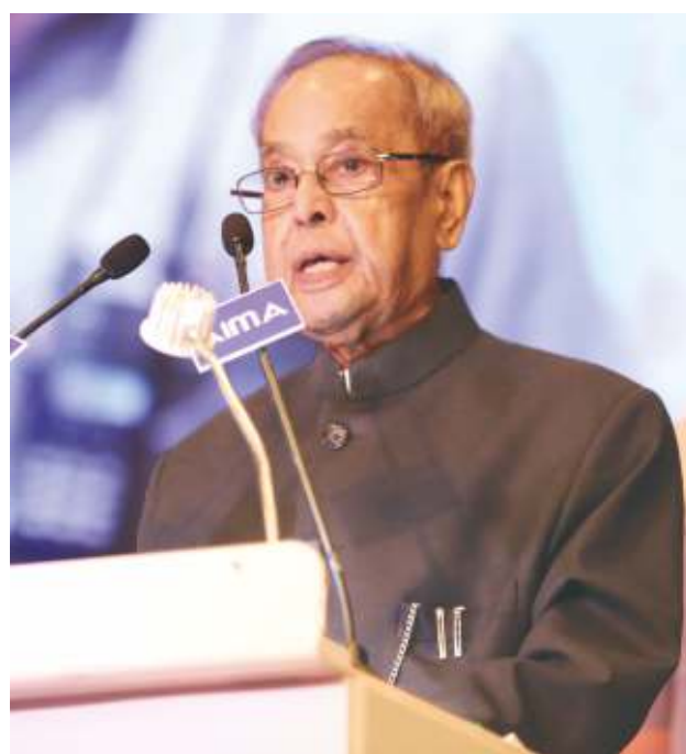
Former President of India, Pranab Mukherjee