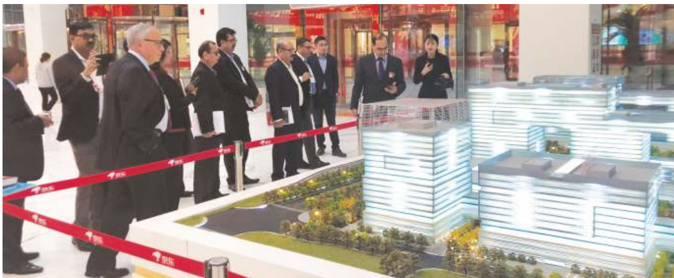
Participants at JD.Com