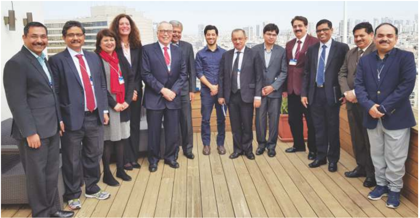
Participants of the 15th Global Advanced Management Programme - Israel