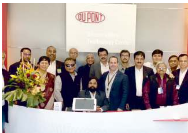
Delegates at DuPont Innovation Centre