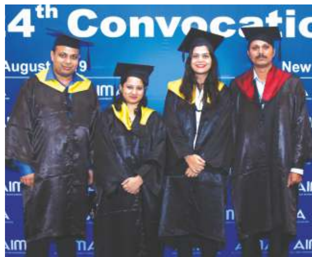
Gold medalists of the batch of 2018

The 24th AIMA Convocation was held on 19th August 2019 at New Delhi. 1190 students were awarded Diplomas/Certificates in various programmes including the flagship