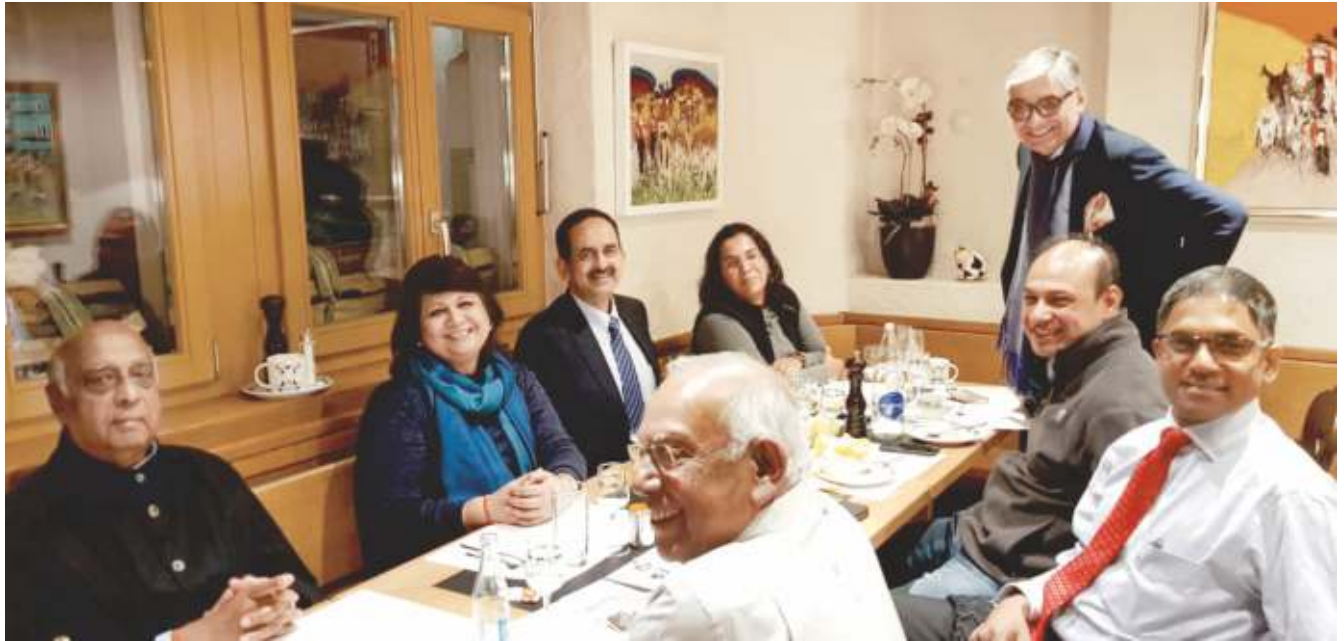
The AIMA delegation for the St Gallen Symposium