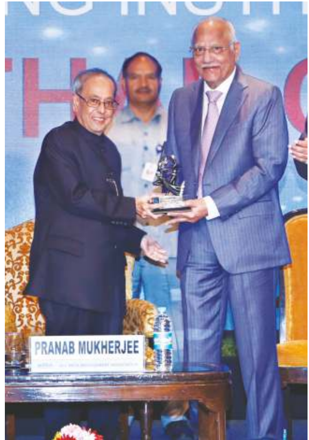
Prathap C Reddy, Founder-Chairman, Apollo Hospitals Group receiving the Outstanding Institution Builder Award from Pranab Mukherjee, Former President of India

Mr Rajkumar Hirani, Director, Producer, Writer & Editor, was awarded Director of the Year for 'Sanju'. Mr Rohit Bal, Renowned Fashion Designer, read the citation.