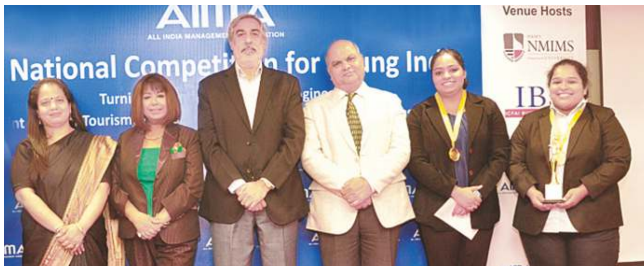
Winners of National Competition for Young India