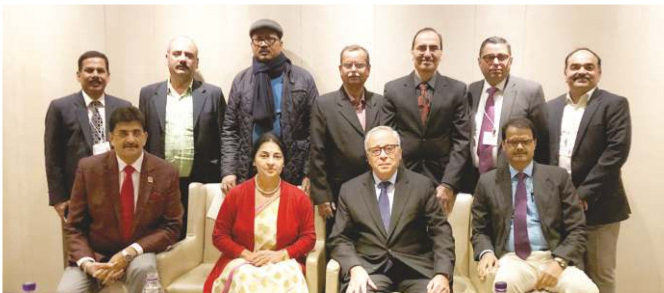
Participants of the 14th Global Advanced Management Programme-China