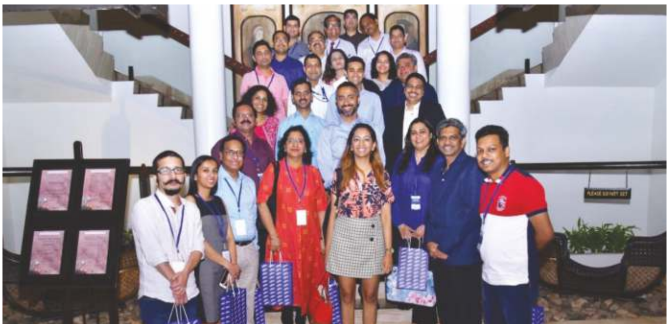
Participants and speakers at the 4th Digital & Social Marketing Retreat