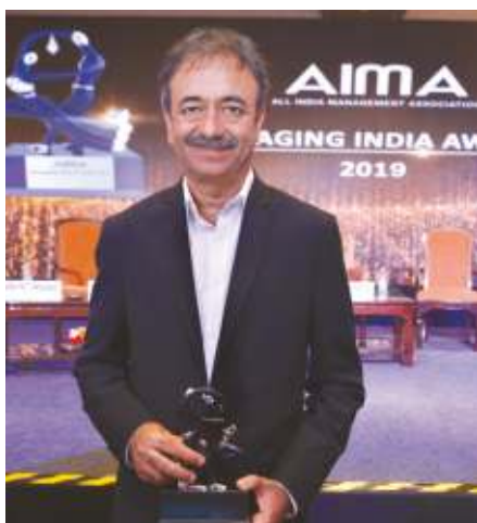
Rajkumar Hirani, Director, Producer, Writer & Editor with the Director of the Year Award