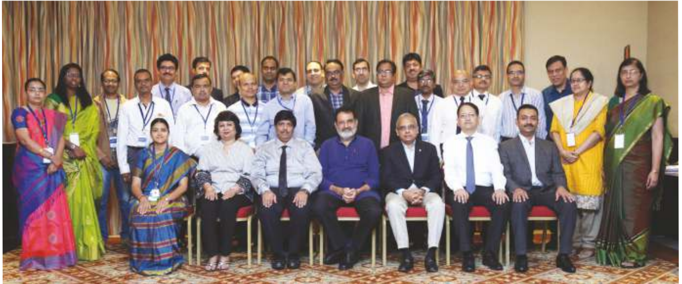
Participants of the Leadership Development Programme at Dubai

AIMA organised a Leadership Development Programme for State Bank of India officials from 7th – 9th December 2018 at Dubai. The theme of the programme was ‘Innovation in Times of Disruption’.