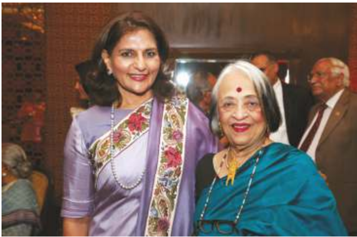
Preetha Reddy, Past President, AIMA & Executive Vice Chairperson, Apollo Hospitals Enterprise Ltd and Anjolie Ela Menon, Eminent contemporary artist