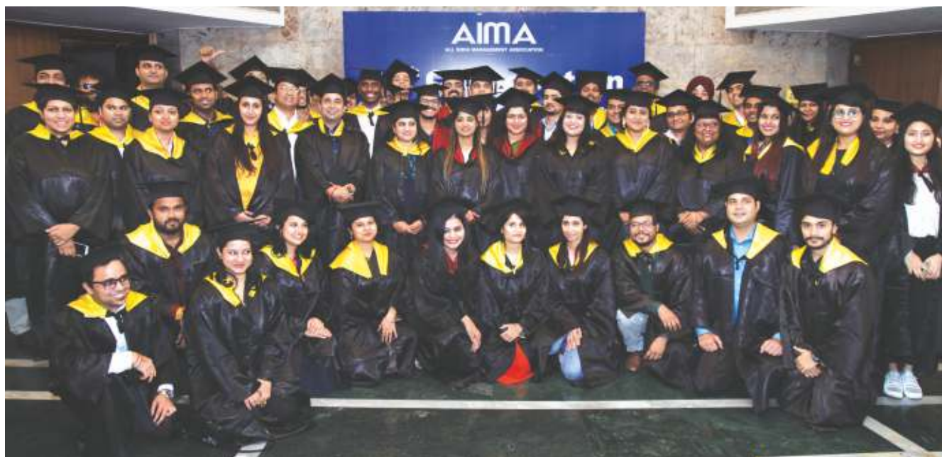
AIMA students at the 24th Convocation

AIMA offered Post Graduate Diploma programmes during the year including the flagship programmes Post Graduate Diploma in Management (PGDM); Post Graduate Diploma in Information Technology Management (PGDITM); Post