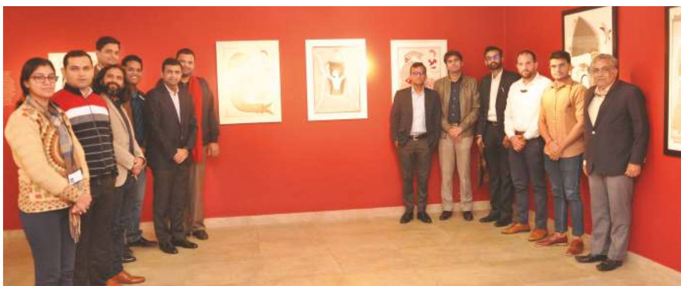
Young Leaders Council members at Ojas Art Gallery