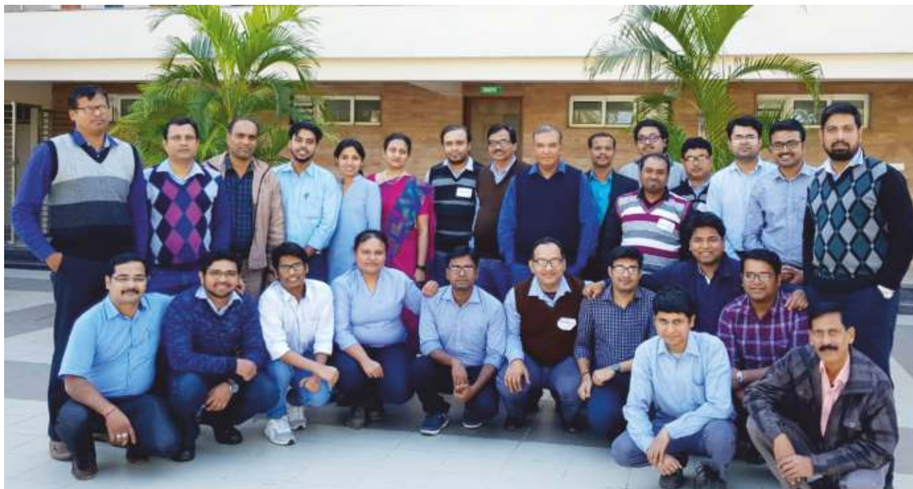
Participants of In-Company Training Programme

Graduate Certificate in Management (PGCM); Professional Diplomas in the major functional areas of management including Marketing, Finance, HRM, International Business and Operations Management; Advanced Certificate in Management; Professional Diploma in Public Procurement (PDPP); Certificate Programme on Contractual Dispute Resolution; Advanced Certificates in HRM, Finance, Marketing, International Business; Professional Diploma in Digital Marketing; Professional Diploma in Business Analytics; Financial Modelling programme and the PhD in Business Administration programme offered in collaboration with Aligarh Muslim University.