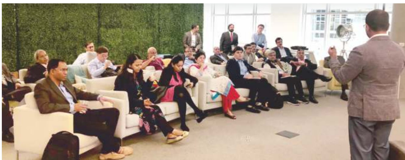
Participants at Standard Chartered Bank