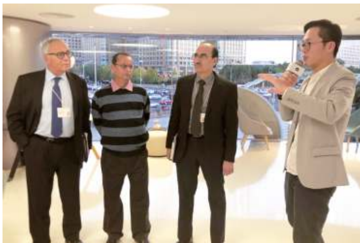
GAMP delegates at NIO car presentation