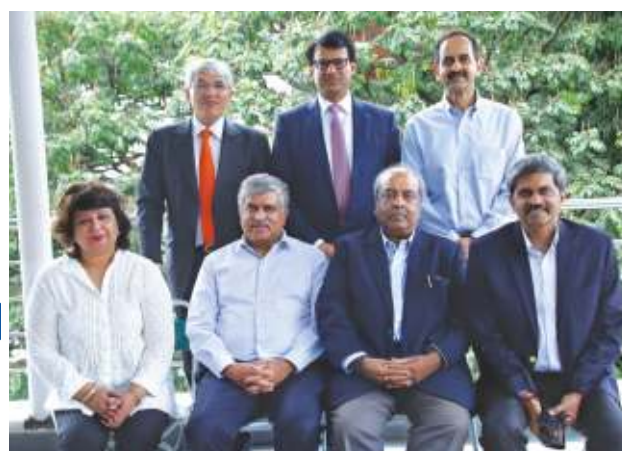
AIMA Award Jury Members