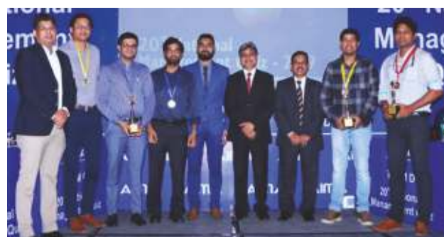
Winning team of National Management Quiz

The 45th National Competition for Young Managers was organised on the theme 'Smart Organisation: Innovative, Capable, Competitive'. The regional rounds were held at Kolkata, Bengaluru, Mumbai and Delhi. The Grand Finale was held on 30th August 2019 at New Delhi.