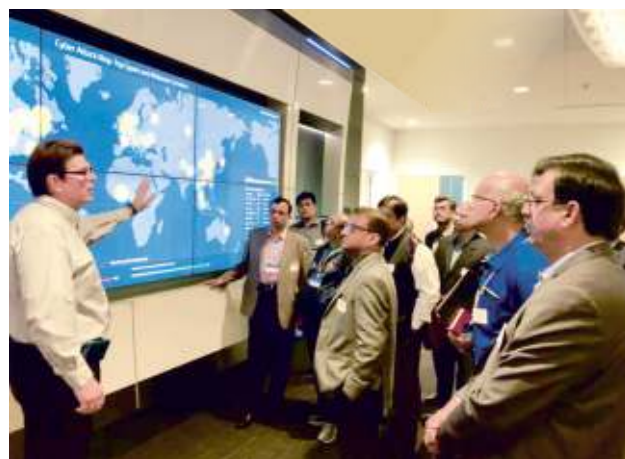
GAMP participants at Cisco

At the end of the programme, the participants presented an innovative business model for their companies to a Jury comprising of senior executives from Silicon Valley. The delegates were also conferred with the 'Global Advanced Management Programme' Certificate.