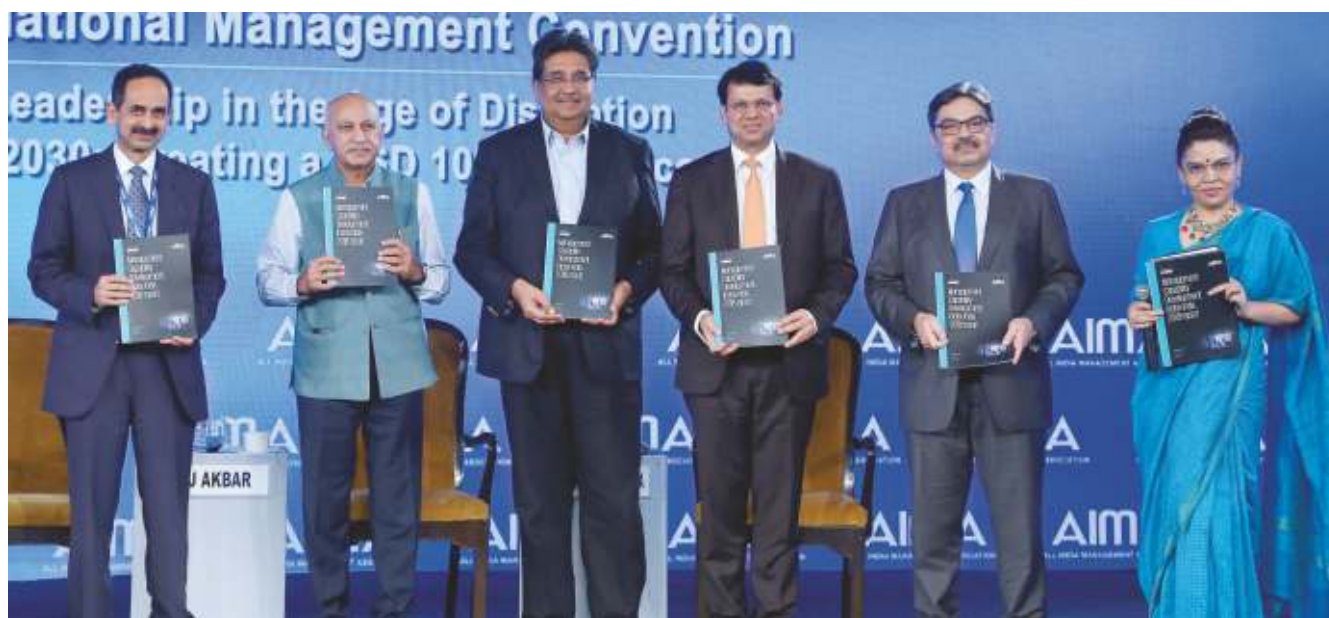
AIMA - KPMG Management Capability Development Index Report release