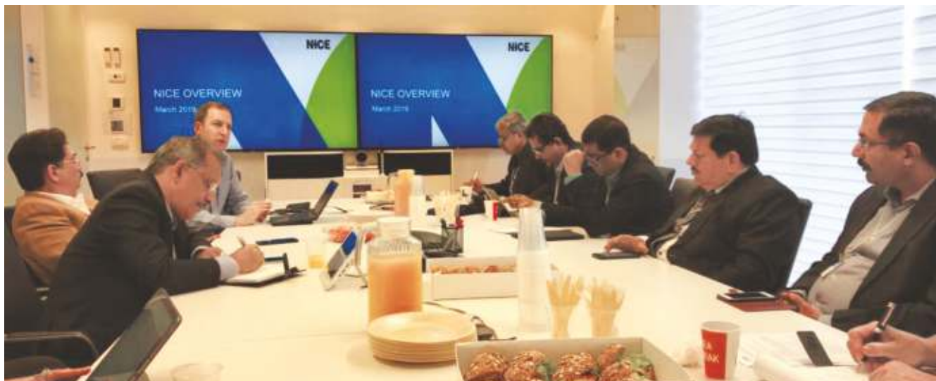
Participants at Nice Technologies