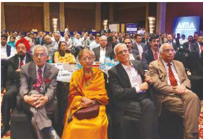
AIMA Past Presidents and other guests at the awards ceremony