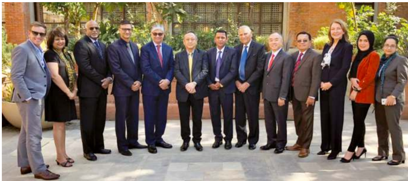
AAMO representatives at the Council Meeting