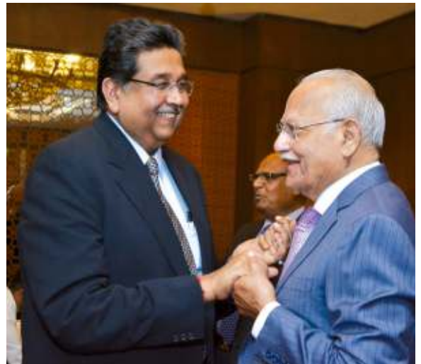
Harshavardhan Neotia, President, AIMA and Chairman, Ambuja Neotia Group and Prathap C Reddy, Founder-Chairman, Apollo Hospitals Group