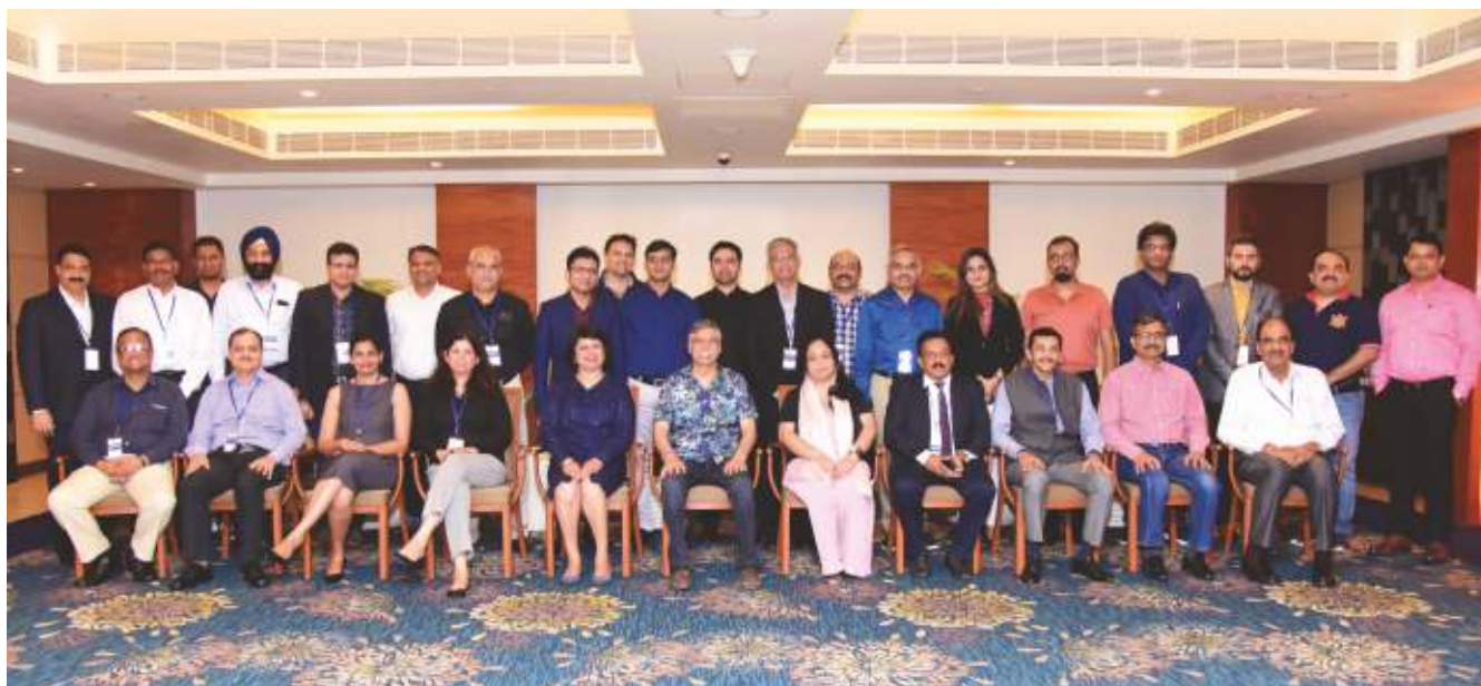
Participants of the 9th Senior Leadership Retreat Programme

AIMA organised the 9th edition of its Senior Leadership Retreat on the theme 'Agile Leadership: Digitisation, Disruption, Growth' from 14th – 16th December 2018 at Goa. The Retreat was organised under the Chairmanship of Mr Sunil Kant Munjal, Past President, AIMA & Chairman, Hero Enterprise.