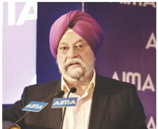
Hardeep Singh Puri, Minister of State (I/C) for Housing and Urban Affairs, Civil Aviation and Minister of State for Commerce and Industry, Government of India