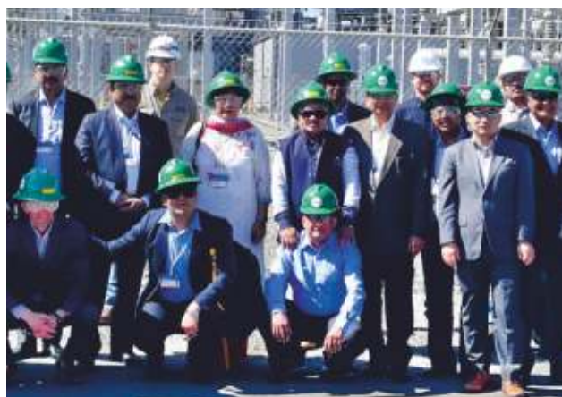
Delegates at Calpine Corporation