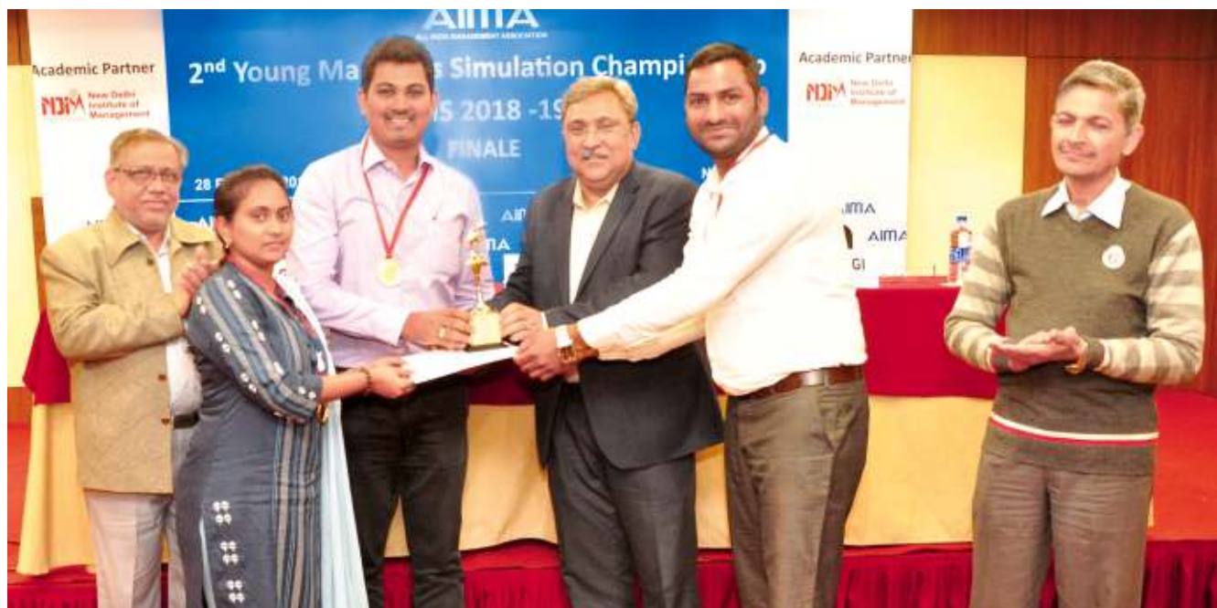
Winning team of the 2nd Young Managers Simulation Championship

AIMA has been organising business simulation competitions for managers and students to sharpen their strategy and decision making skills in a simulated environment. They get a flavour of running a corporation towards profitability amidst competition by efficient utilisation of human, financial and material resources; identifying opportunities and dealing with crisis in business.