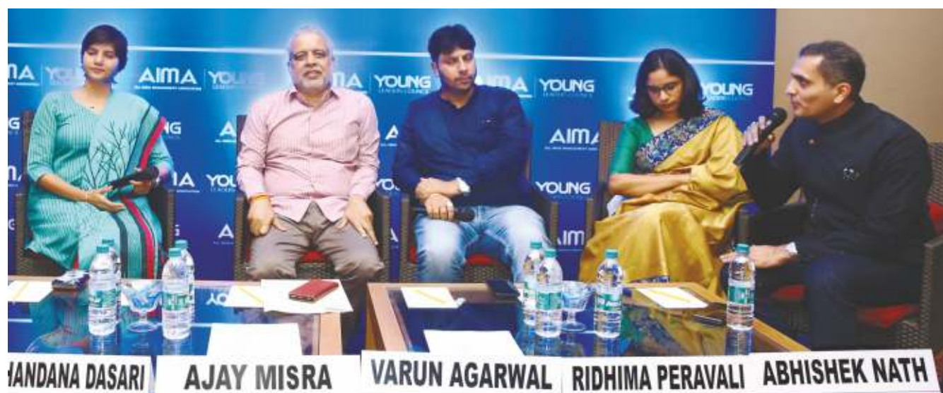
YLC Hyderabad Chapter session on 'Making Smart Cities for attracting Capital and Talent'