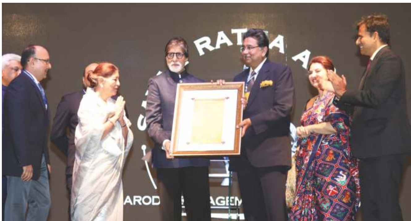
Amitabh Bachchan receiving the Sayaji Ratna Award organised by Baroda Management Association