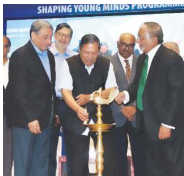
Inauguration of the SYMP at Jamshedpur

The AIMA library is a rich resource centre, providing multifaceted services and facilities to meet the growing requirement of the management world. The library services have now been enhanced and members across India can