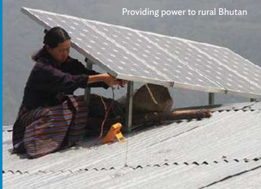
Providing power to rural Bhutan

ADB is meeting these challenges with an increased emphasis on climate change, innovation, addressing inequality, strengthening support for middle-income countries, and promoting resilience to disasters.