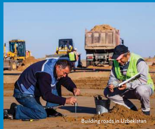
Building roads in Uzbekistan

What we do: ADB helps to develop the region and its people by working with governments and private companies, providing women and girls more opportunities, supporting good government practices, and partnering with people and groups across society. ADB's work focuses on infrastructure; the environment, including climate change; regional cooperation and integration; financial sector development; education; and health.