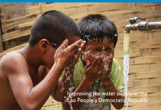
Improving the water supply in the Lao People's Democratic Republic

What we do: ADB helps to develop the region and its people by working with governments and private companies, providing women and girls more opportunities, supporting good government practices, and partnering with people and groups across society. ADB's work focuses on infrastructure; the environment, including climate change; regional cooperation and integration; financial sector development; education; and health.