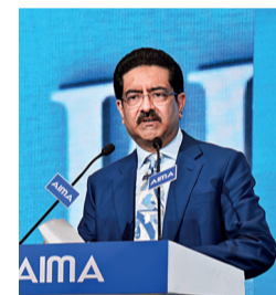
Kumar Mangalam Birla, Chairman, Aditya Birla Group recipient of the AIMA Business Leader of the Decade Award