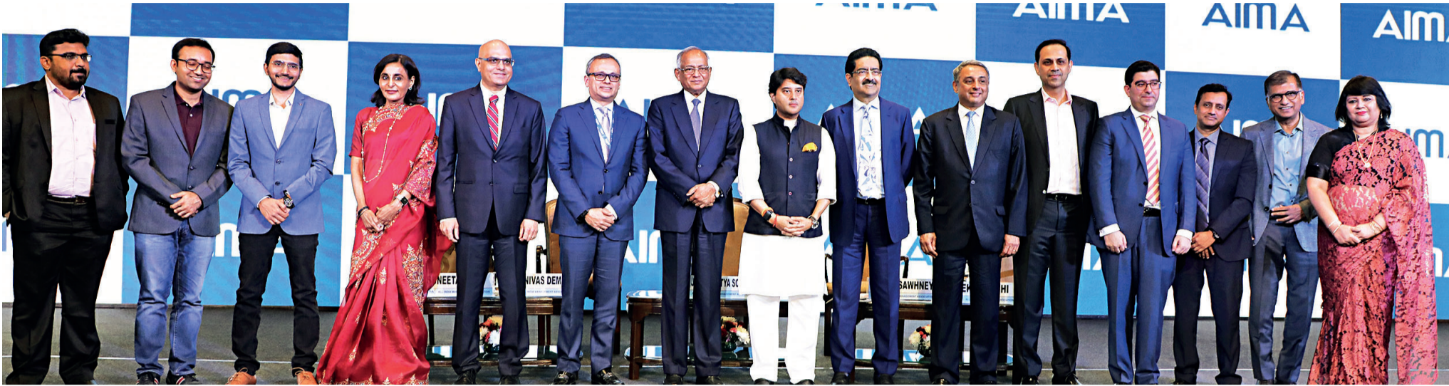
Jyotiraditya Scindia, Minister of Civil Aviation and Steel, Government of India with AIMA Managing India Award winners and AIMA Office Bearers