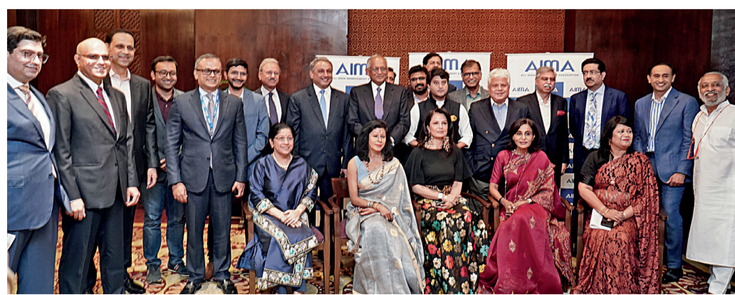
Jyotiraditya Scindia, Minister of Civil Aviation and Steel, Government of India with Managing Indian Award winners, citation readers, AIMA office bearers and other dignitaries