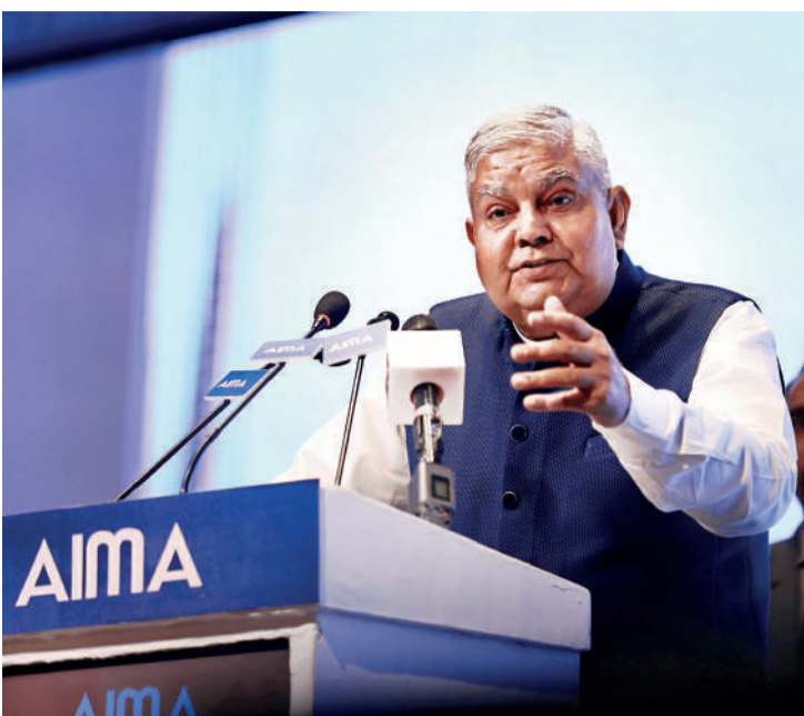
Jagdeep Dhankhar, Vice President of India, addressing the 49th National Management Convention