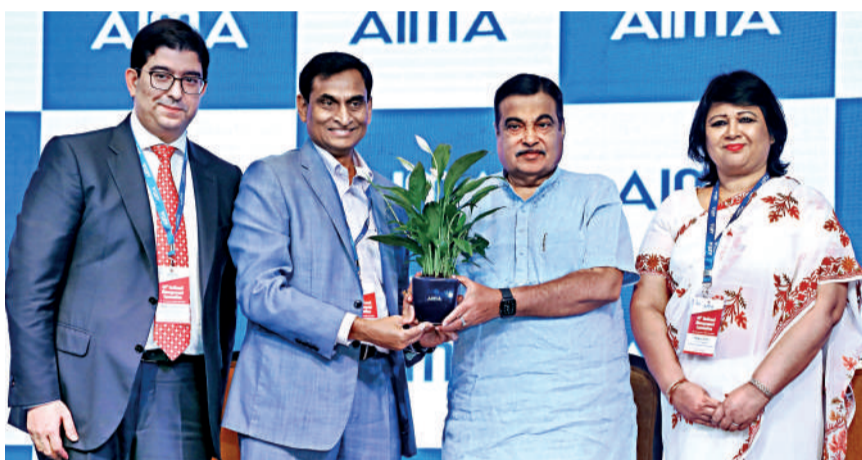
(L-R) Nikhil Sawhney; C K Ranganathan; Nitin Gadkari, Minister of Road Transport & Highways, Government of India, and Rekha Sethi

maximise India's advantage on the world stage." "We have an import of at least 16 lakh crores of fossil fuel and that is a big problem for the country as it creates pollution. We have taken a decision to make 27 green express highways to reduce time and pollution," said Nitin Gadkari, Minister of Road Transport and Highways, Government of India, while speaking at the convention. He laid emphasis on using public transport and added that new research and innovation on public transport, which can run using sustainable fuel, is imperative. Highlighting India's potential to