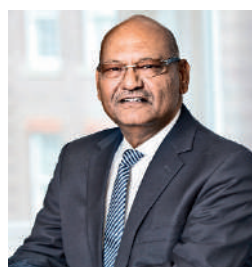
Anil Agarwal, Founder and Chairman of Vedanta, who addressed a session on 'The unstoppable: Leading Vedanta's relentless growth'

India's mining maharaja, Anil Agarwal, Founder and Chairman, Vedanta, was in virtual conversation with Sanjiv Goenka. They discussed the restructuring of his group to extract greater value for the shareholders from the prevailing commodity boom