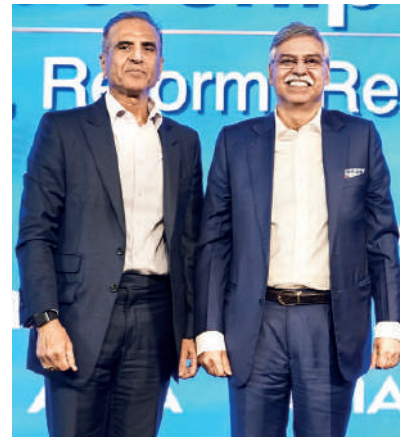
Sunil Bharti Mittal, Founder and Chairman, Bharti Enterprises and Sunil Kant Munjal, Chairman, Hero Enterprise