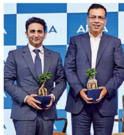
Adar Poonawalla, Chief Executive Officer, Serum Institute of India and Sanjiv Goenka, Conclave Chairman and Chairman, RP-Sanjiv Goenka Group