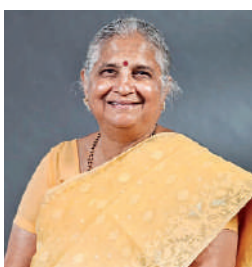
Sudha Murty, Chairperson, Murty Foundation & Author and Social Worker who addressed a session on 'Changing lives: Philanthropy beyond money'