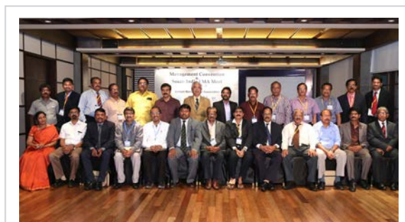
Participants at the South India LMA Meet