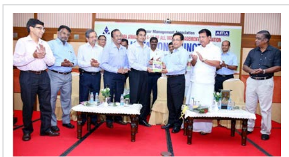
Launch of the TMA Bulletin 'The Management Voice'