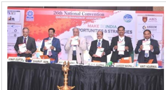
Chief Guest releasing the souvenir