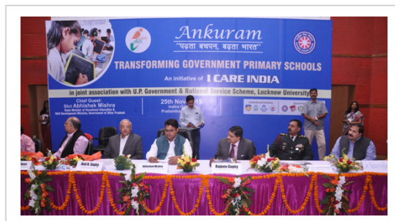
Project for Transforming Government Primary Schools, in progress