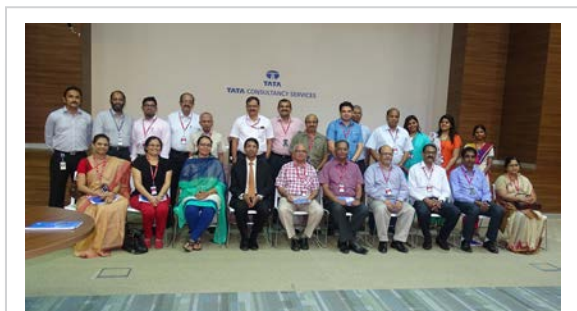
Participants of Industrial Visit