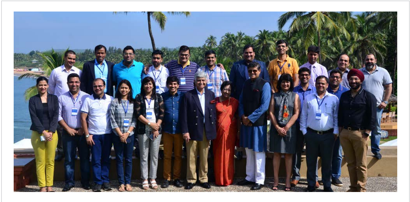
Participants at the 4th Young Leaders Retreat