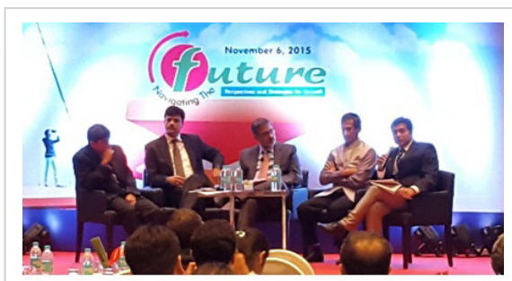
Panelists at the 17th Finance Convention