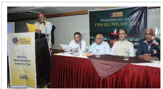
Panelists at the programme