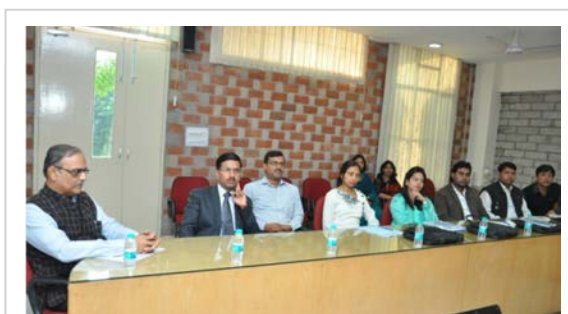
Session being inaugurated