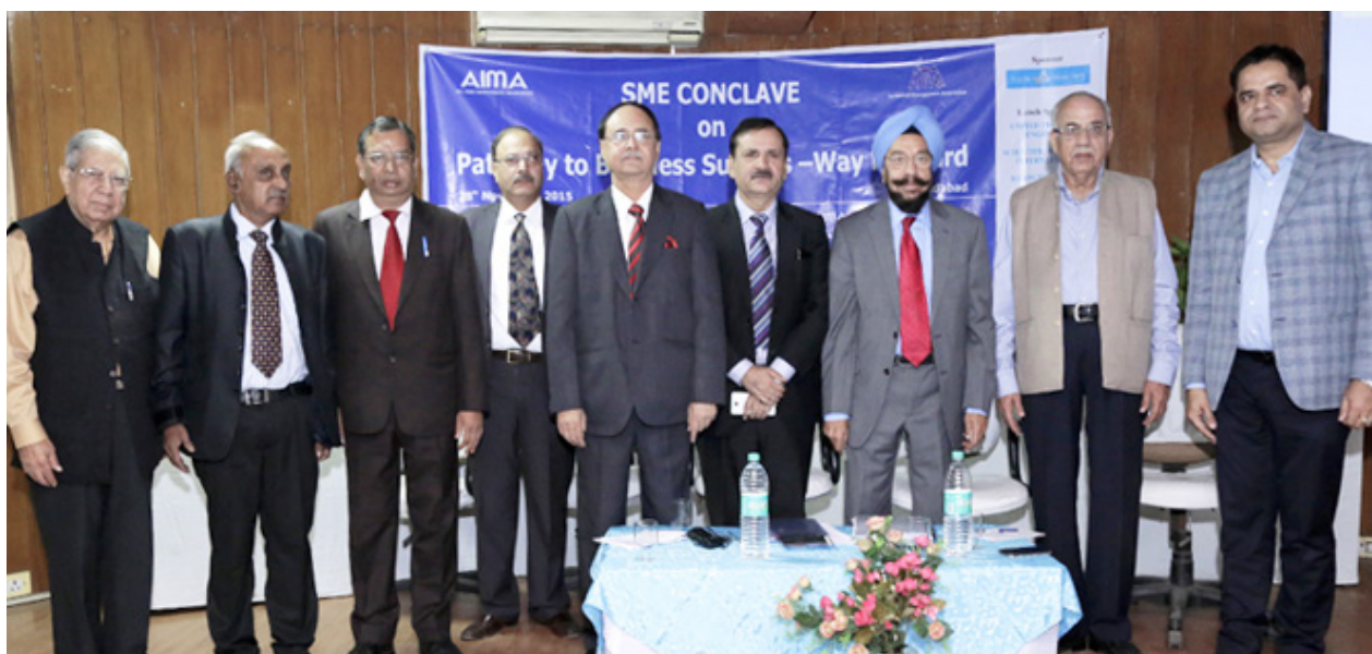
SME Conclave in progress