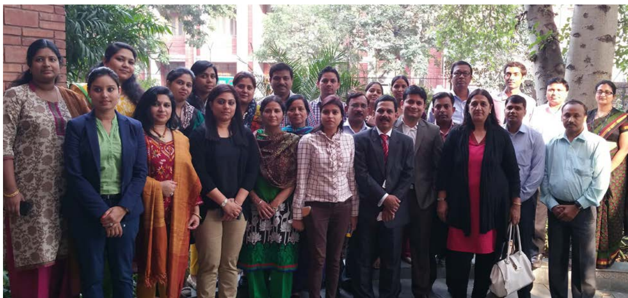
Participants at the training programme

AIMA organised a two-day training programme on 'Behavioural Skills for Executive Assistants / Secretaries' on 26th – 27th November 2015 at New Delhi. The training programme was for administrative professionals, including Executive Assistants, Office Secretary and Executive PA, Secretaries or other members of the administrative support staff who need to expand their skills so they can better support their manager/s and organisation.