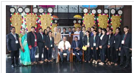
Goa students in Kerala along with faculty of both the colleges and Office Bearers of GMA and VMA in Kerala.

Goa Management Association (GMA) in association with Vaikom Management Association (VMA) organised a Student Exchange Programme for the management students of SV'S Sridora Caculo College of Commerce and Management Studies, Goa. There were 16 students and one faculty who stayed in Kerala for one week to get a view about the educational system in Kerala. There were several programmes organised for the students and they also participated in the Management Convention organised by Vaikom Management Association.