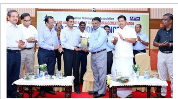
Dignitaries at the Award presentation