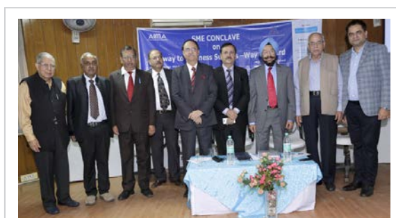
Speakers at the SME Conclave