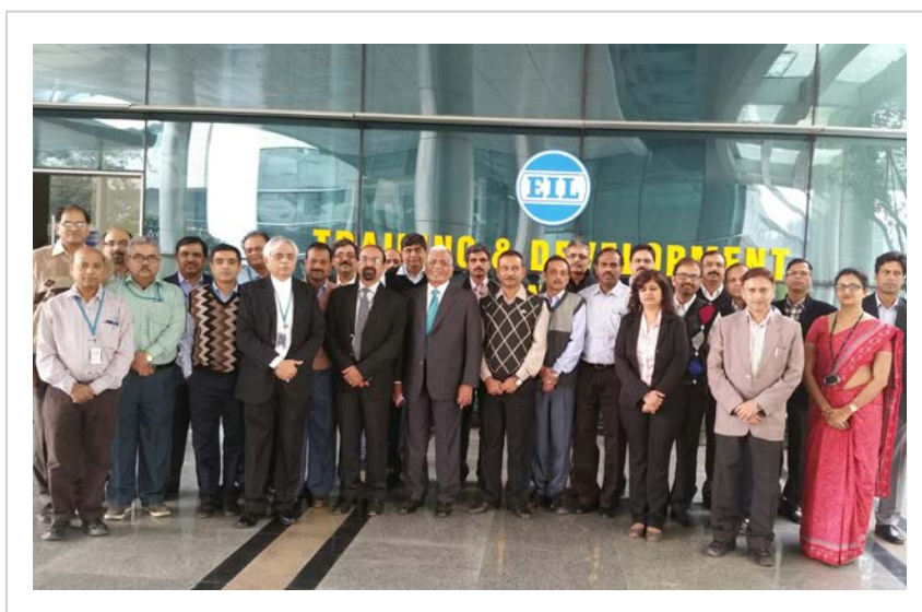
Participants of the In-company training at EIL

AIMA organised a series of training programmes for EIL in the month of November. A one day