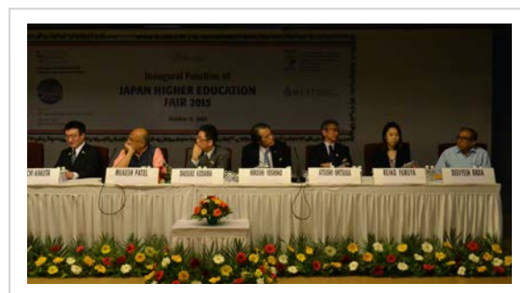
Inauguration of Japan Higher Education Fair