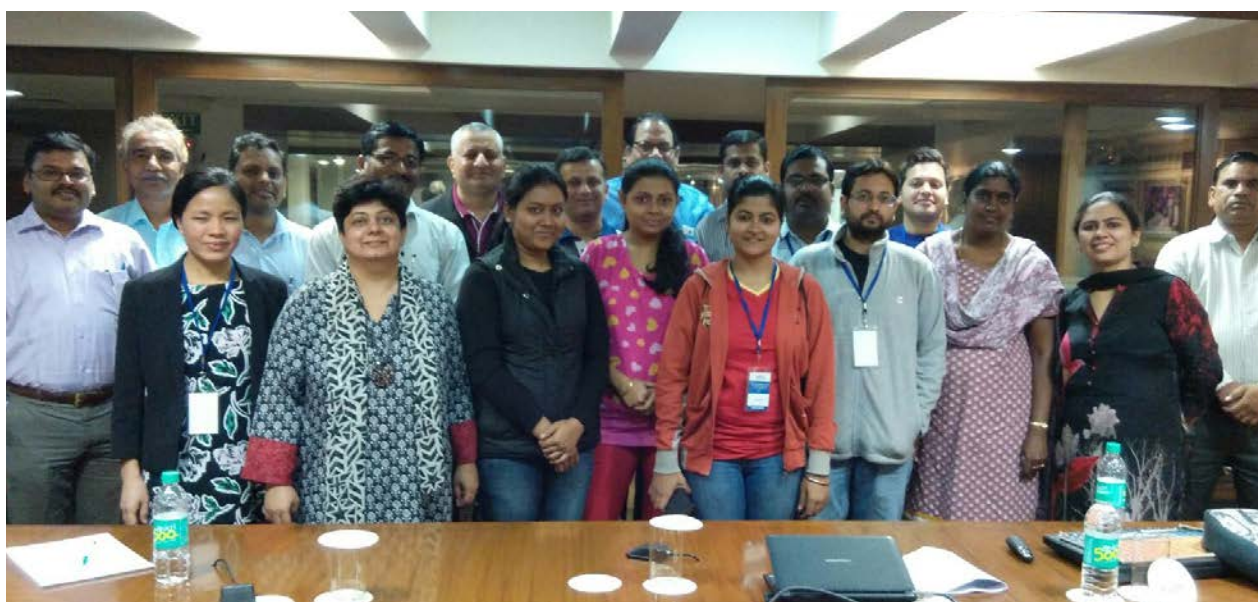
Participants at the workshop for Professional Diploma in Public Procurement