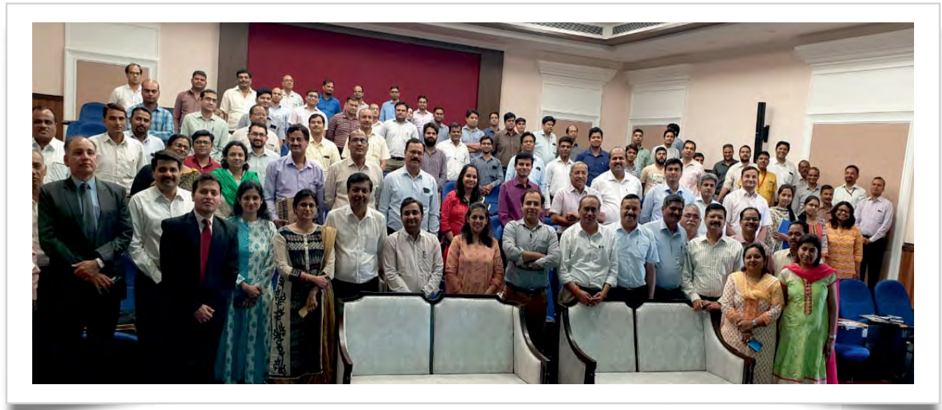
Participants at the training programme

AIMA organised a training programme on 'Procurement in e-Governance Domain' for employees of Madhya Pradesh Agency for Promotion of Information Technology, Government of Madhya Pradesh on 9th-10th May 2019 at Bhopal. Some of the topics