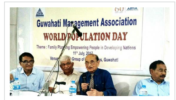
A session on 'Family Planning' in progress