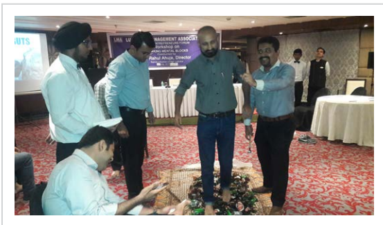
Walking on broken glass at the workshop on 'Breaking Mental Blocks'