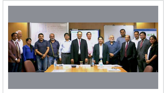
Participants at the seminar