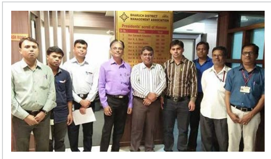
Participants at the programme on ‘Hygiene and 5S’