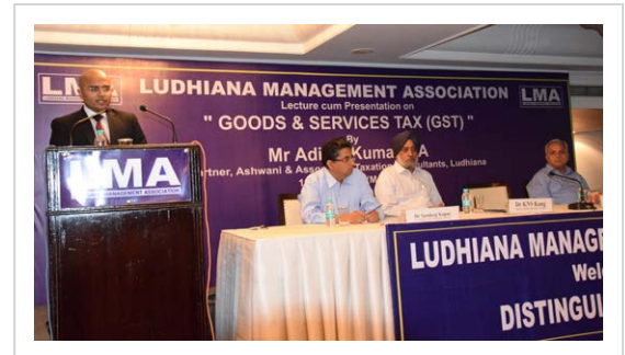
Seminar on 'Implications of GST (Goods and Services Tax)'