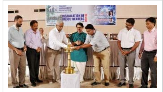
Installation of office Bearers 2017-18