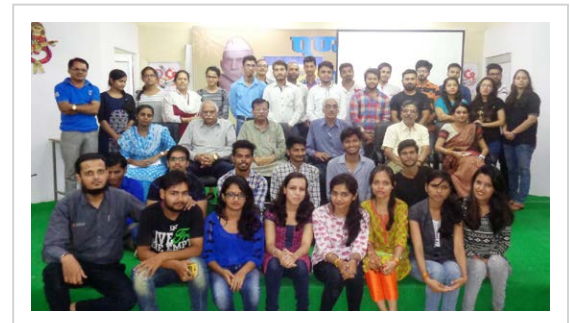
Participants at the session