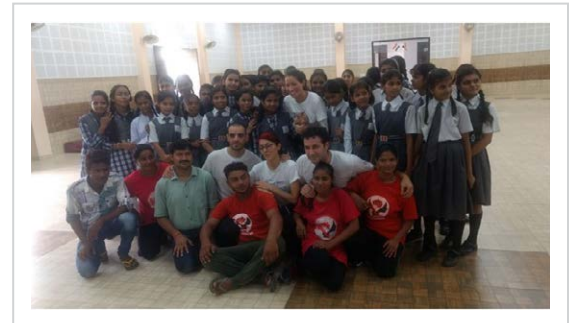
Participants at workshop on self defence