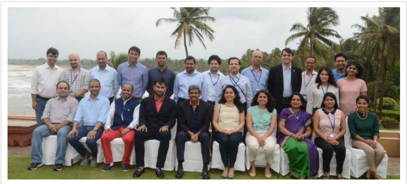
Participants and speakers at the 5th Marketing Retreat