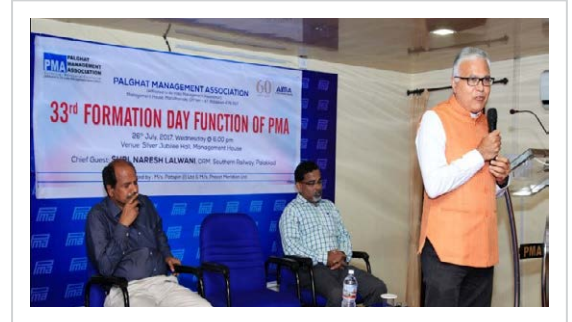
33rd Formation Day Function