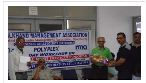
Felicitation of the speaker