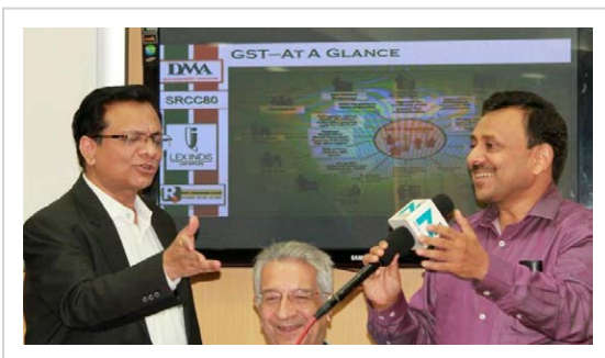
Eminent Speakers addressing the participants