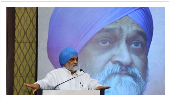
Mr. Montek Singh Ahluwalia addressing