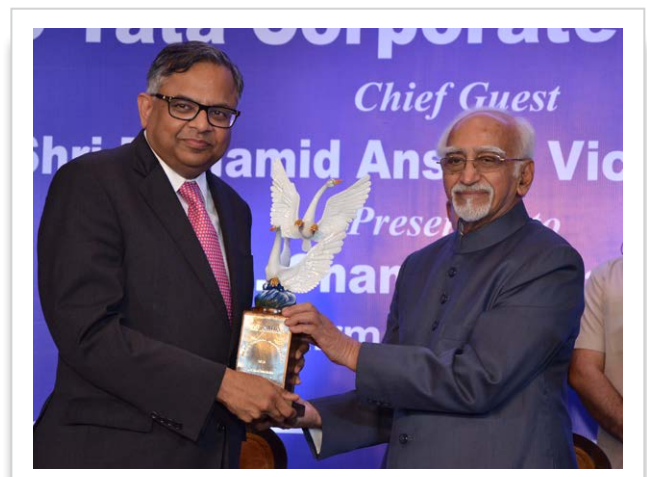
(L-R) N. Chandrasekaran, Chairman, Tata Sons Ltd. receiving the AIMA-JRD Tata Corporate Leadership Award from M. Hamid Ansari, then Vice President of India

On receiving the award, Mr N Chandrasekaran