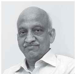
A. S. Kiran Kumar Secretary, DOS & Chairman, ISRO