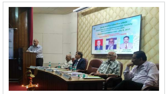
2nd Foundation Day celebrations in progress