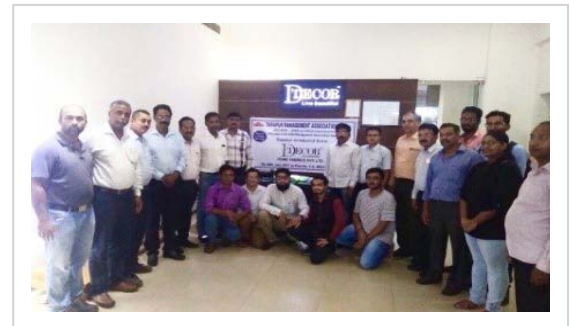
Industrial visit to D’Decor

TMA organised an industrial visit to one of the state of the art textile manufacturing facilities of D’Decor on 28th July. The officials from D’Decor assisted the visiting members of TMA by sharing the brief production process and also accompanied during the walkthrough of the plant. Overall the visit was a great learning experience for all participants.