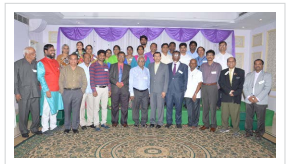
Participants at the Management Development Programme