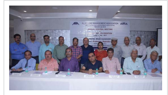
The New Executive Committee 2017-18