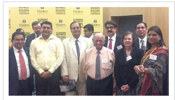
Participants at the programme