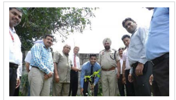
Tree Plantation Programme

Pathankot Management Association organised a Tree Plantation programme on 17th July with DSP S. Ranjit Singh. Student members of PMA planted 100 saplings of different varieties viz ornamental, shadowing and fruit bearing trees. Each student took the responsibility to nourish and maintain the allocated plant.