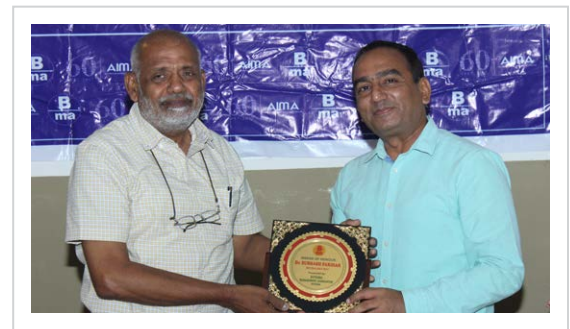
Felicitaton of the speaker