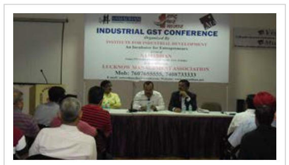
Seminar on GST in progress