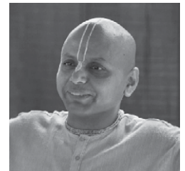
Gaurgopal Das International Life Coach