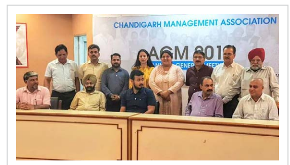
Annual General Meeting