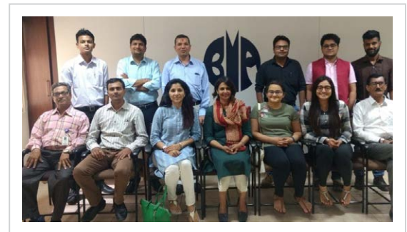
Participants of the MDP Session