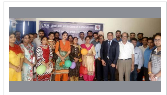
Participants at the training programme