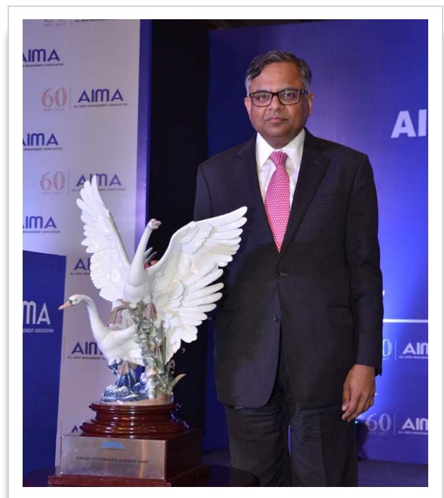
N. Chandrasekaran, Chairman, Tata Sons Ltd. recipient of AIMA-JRD Tata Corporate Leadership Award