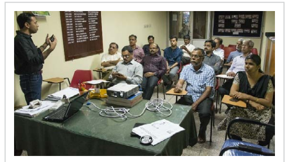
In-house session in progress