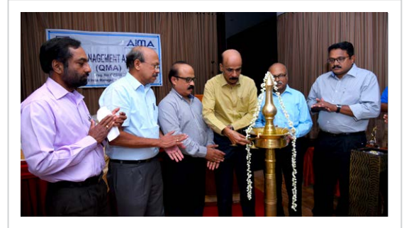
Inauguration by the guests and speakers