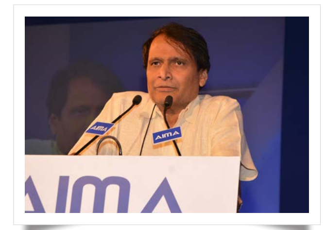
Suresh Prabhu, Minister for Railways, Government of India

AIMA has a fabulous process of selection. All the awardees are from diverse and interesting fields and they have done phenomenal jobs in their spheres, said Mr Suresh Prabhu, Minister for Railways, Government of India. "We have been through various phases since the Independence of our nation. Now we have come to a phase