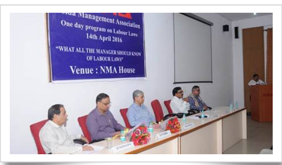
Workshop in progress