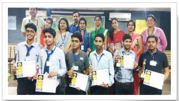
Winning teams of Manthan 2016