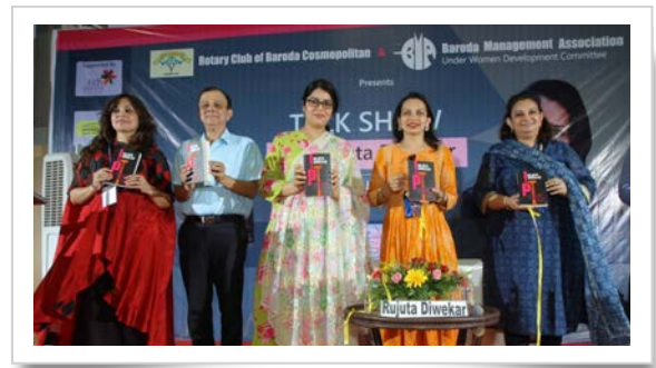
Release of the book 'Thyriod PCOD'