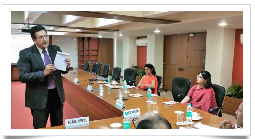
AIMA Certified Trainer (ACT) session in progress

AIMA conducted the first assessment session of AIMA Certified Trainer (ACT) after being endorsed by NOCN, UK on 7th April 2016 at New Delhi.